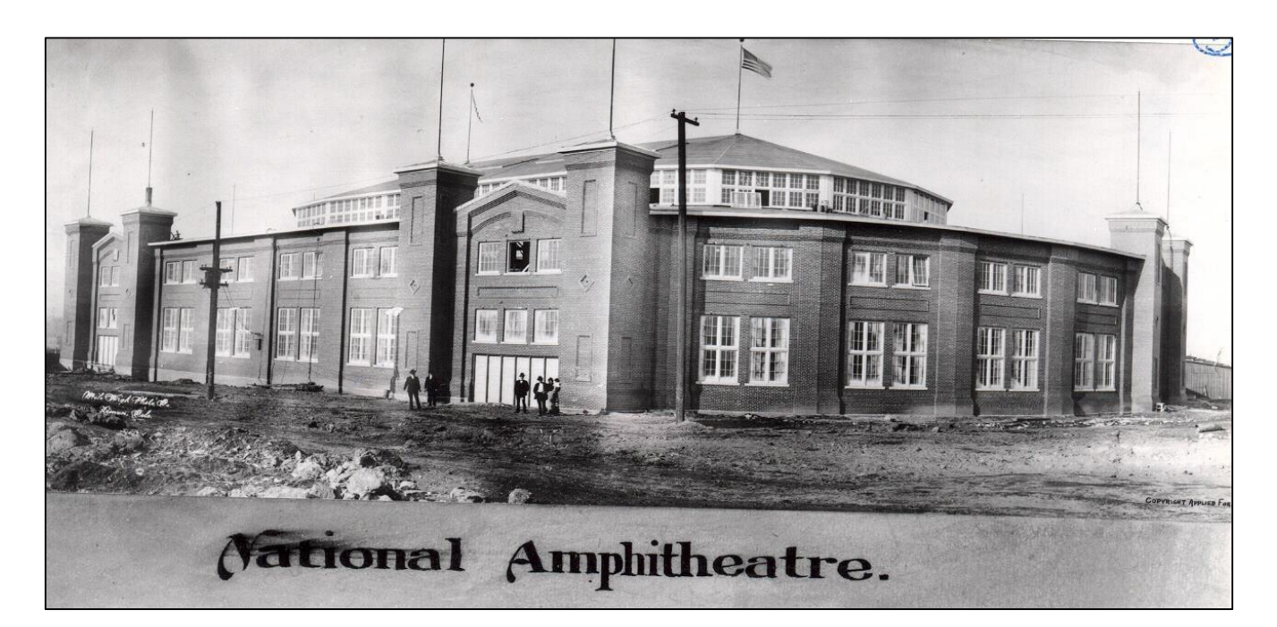
1909 Postcard celebrating dedication in January 1909