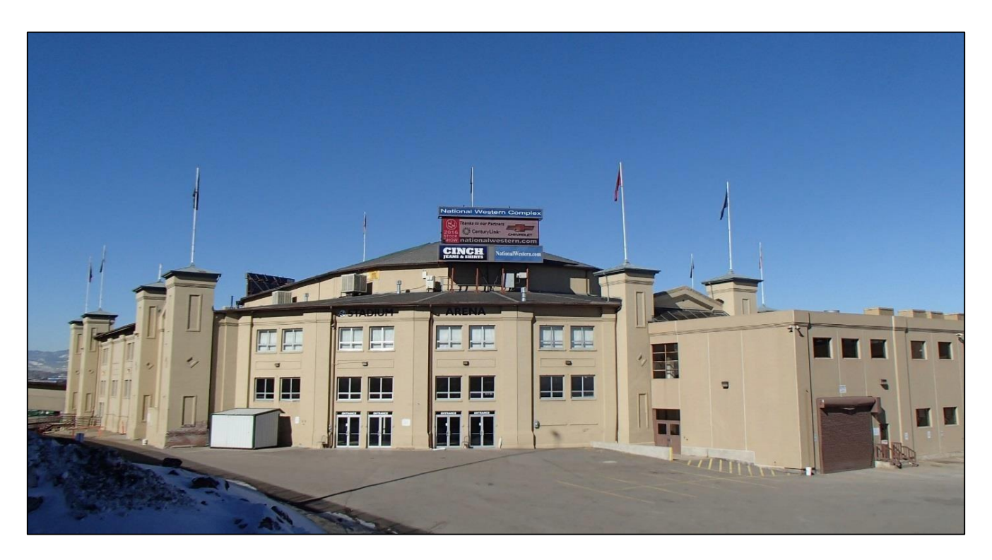
Stadium Arena, East Elevation Photographed by Kathleen Corbett February 9, 2016