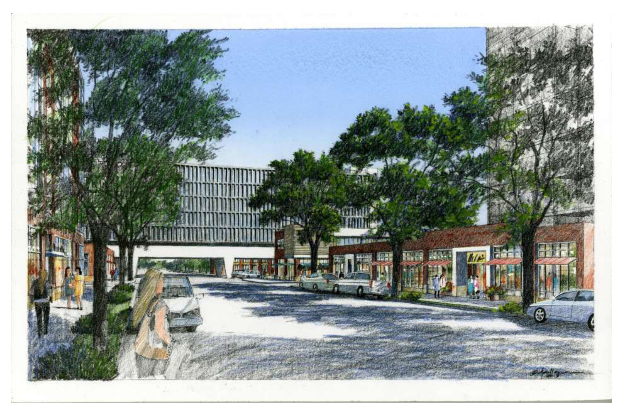
9<sup>th</sup> Avenue Metropolitan District Nos. 1 to 3