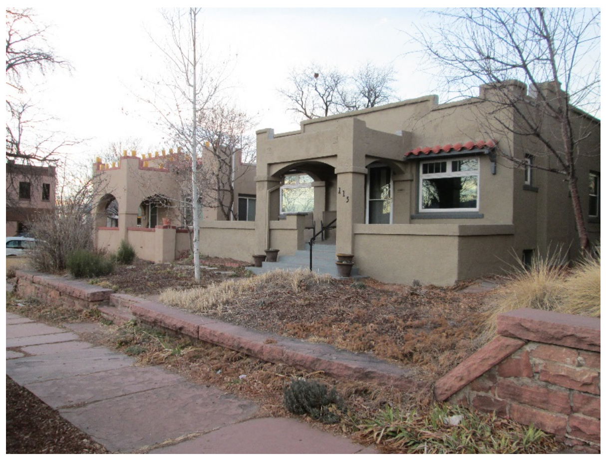
105 and 115 East Vassar Avenue

Franz's development illustrates the growth trends of south Denver along the South Broadway corridor during the pre-Great Depression era.