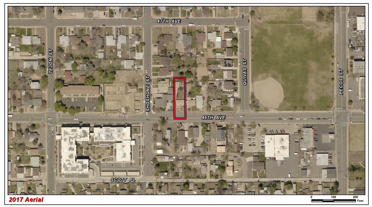
Figure 3: 2017 Aerial Map