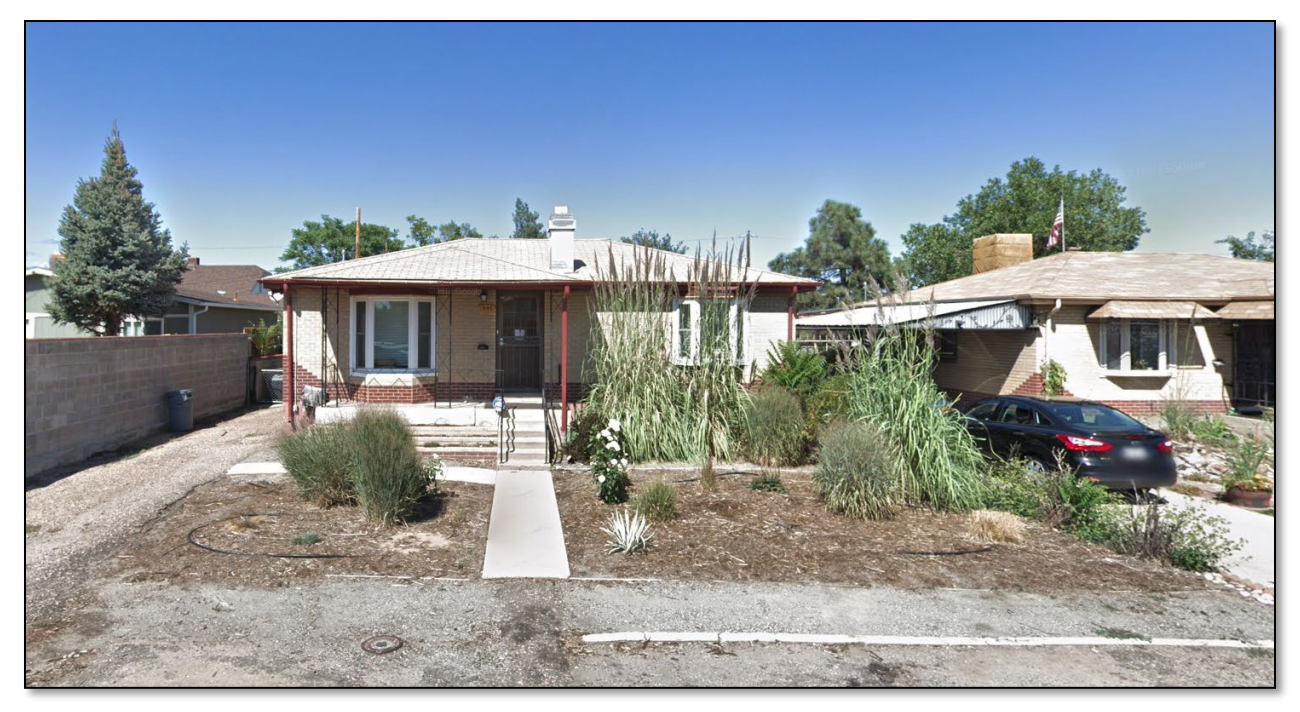
Figure 6b: View of Subject Property from W. 46<sup>th</sup> Avenue with single-family home visible to the right