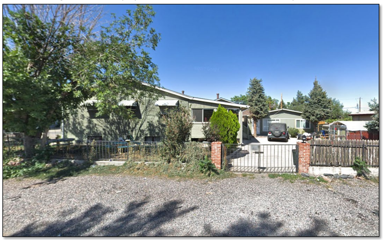
Figure 6e: View of adjacent property to the west