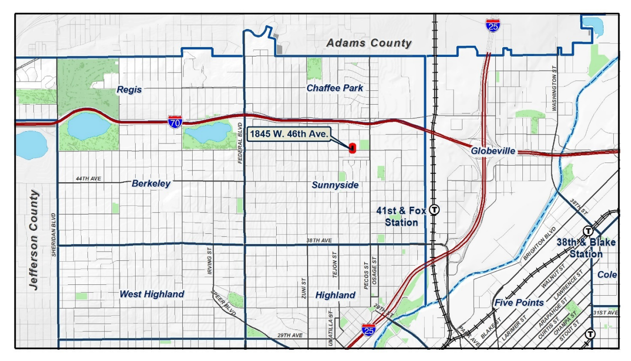
Figure 2: Neighborhood Map