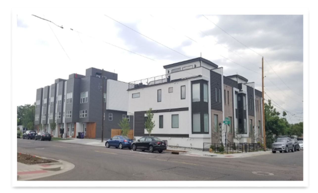
Figure 8: New multi-Unit development at W. 46<sup>th</sup> Avenue and Shoshone Street

The rezoning is justified under DZC Section 12.4.10.8.A.4, "Since the date of the approval of the existing Zone District, there has been a change to such a degree that the proposed rezoning is in the public interest." In this case, the requested rezoning is justified based on section 4.a., that there have been "changed or changing conditions in a particular area," which is evident by the two- and multi-unit developments within close proximity to this parcel.