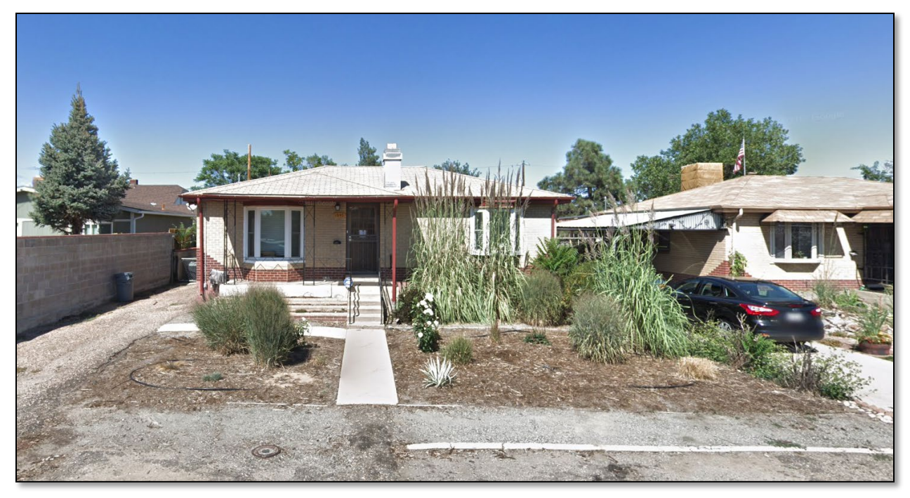
Figure 6b: View of Subject Property from W. 46<sup>th</sup> Avenue with single-family home visible to the right