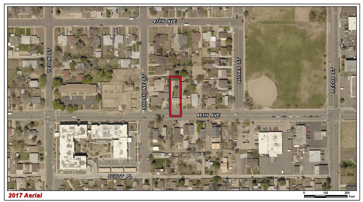
Figure 3: 2017 Aerial Map