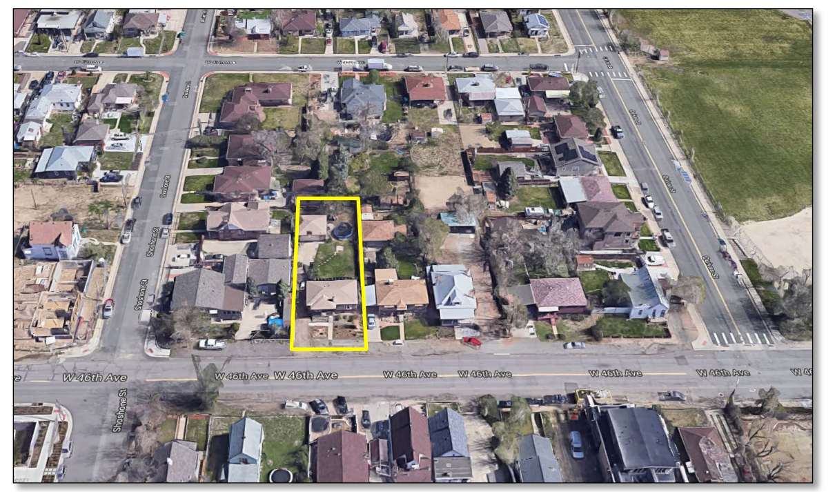
Figure 6a: Aerial View of Subject Property

The existing building form and scale of the subject site and adjacent properties are shown in the images on the following pages.