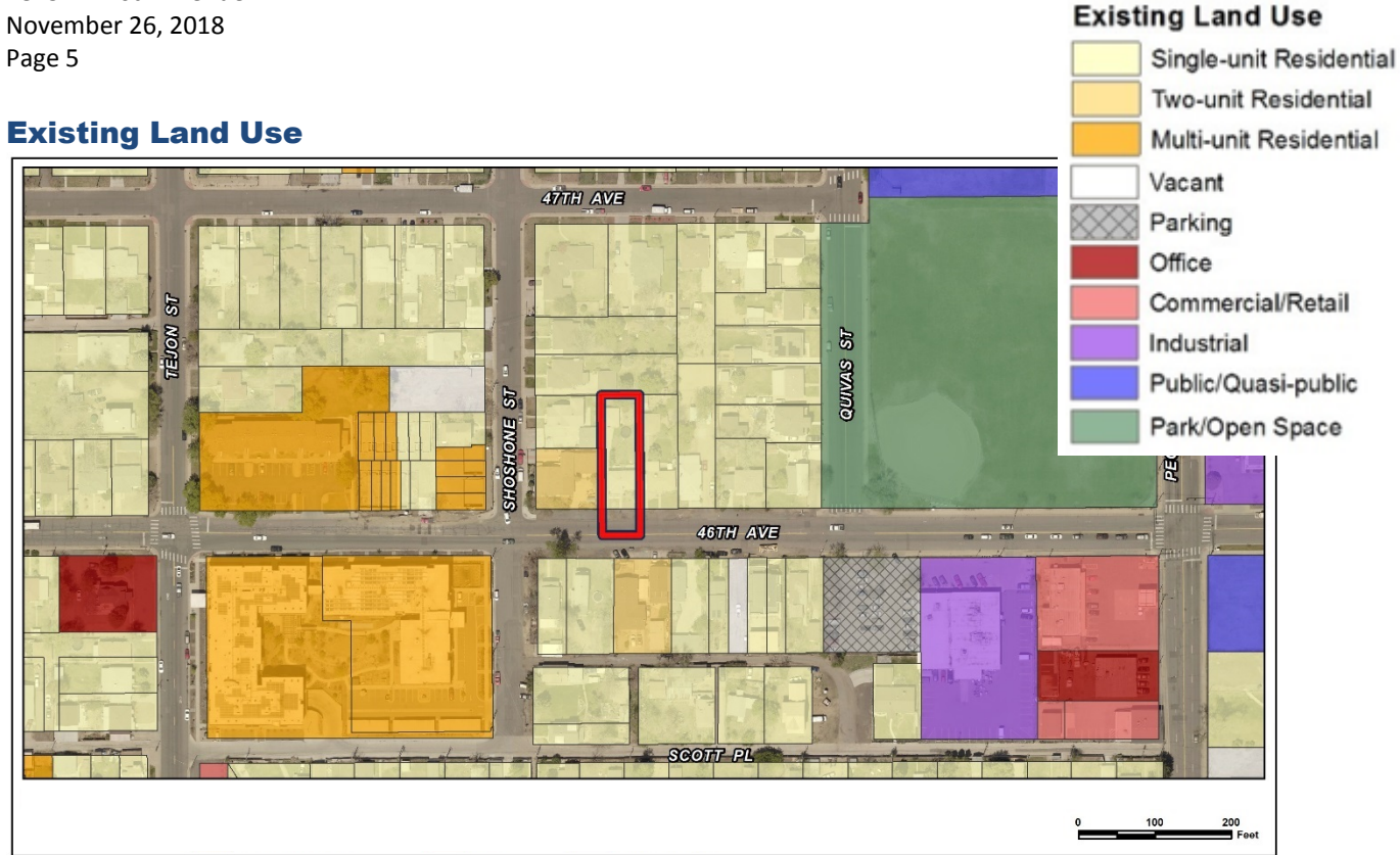
Figure 5: 2016 Existing Land Use Map