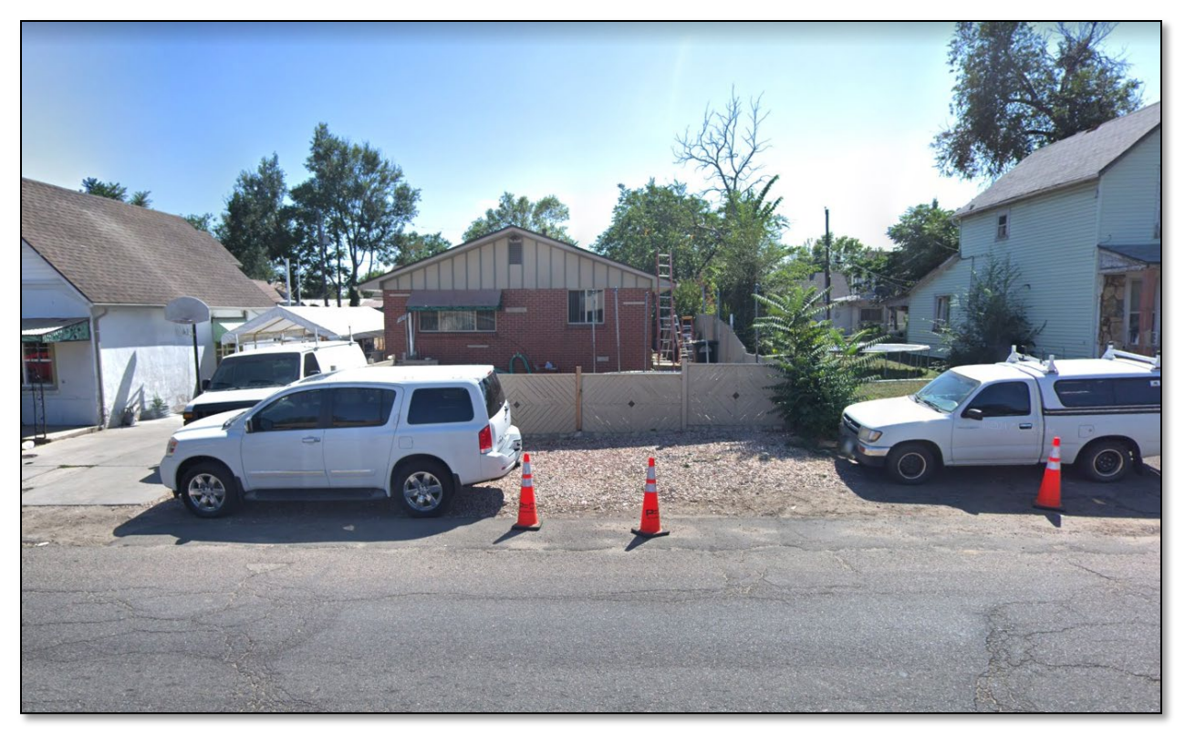
Figure 6d: View of properties across W. 46<sup>th</sup> Avenue, south of subject site