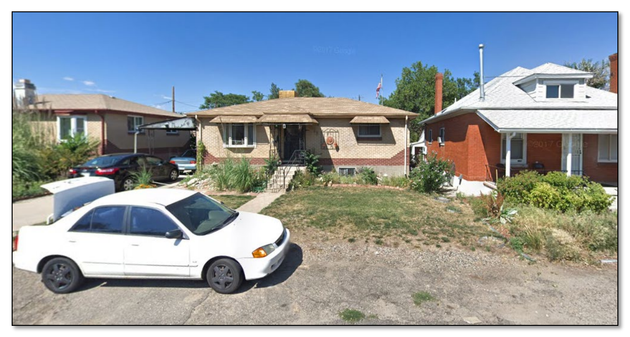
Figure 6c: View of adjacent property to the east with Subject property (left), single family home (right)