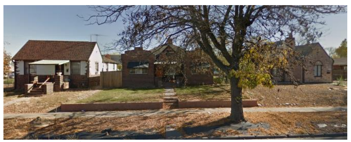
Property to the east of the subject site on York Street, looking east.