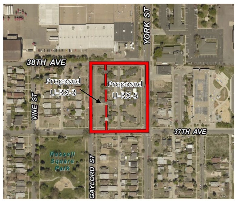
Proposed zone districts