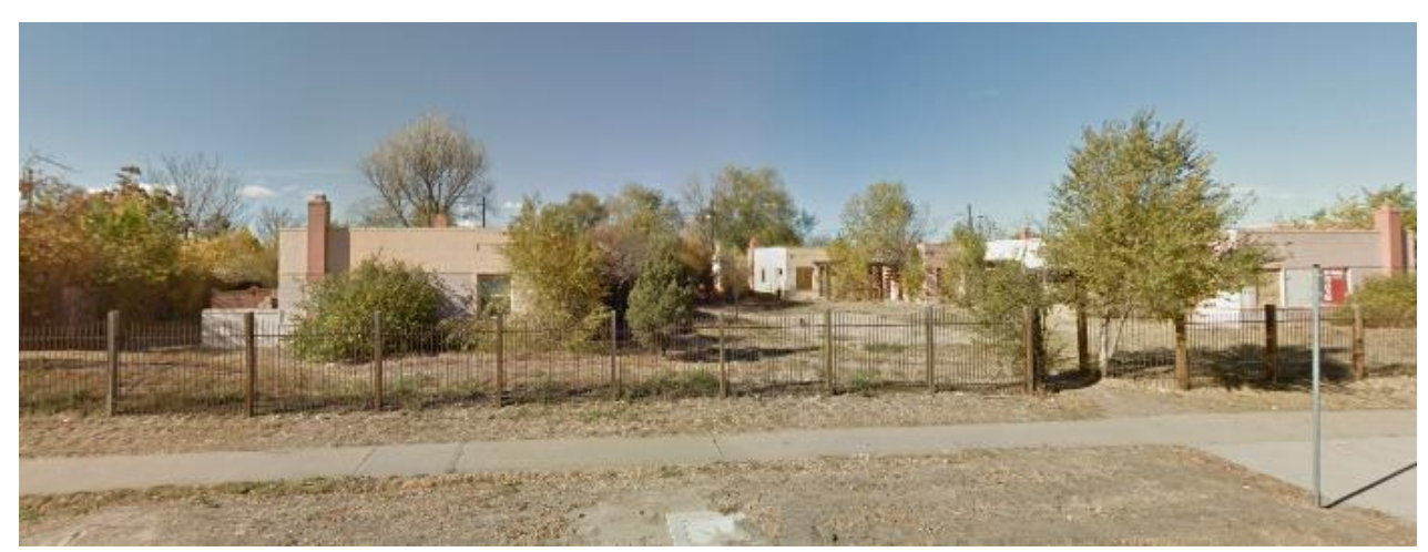
View of subject site on York Street, looking west.