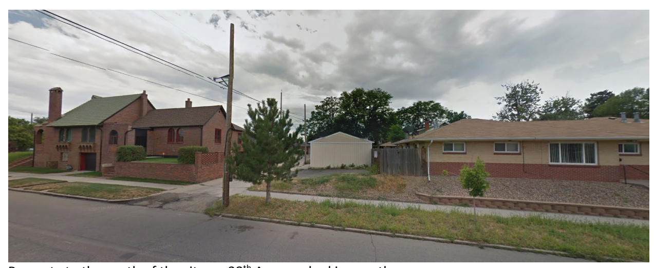
Property to the south of the site on 38<sup>th</sup> Avenue, looking south.