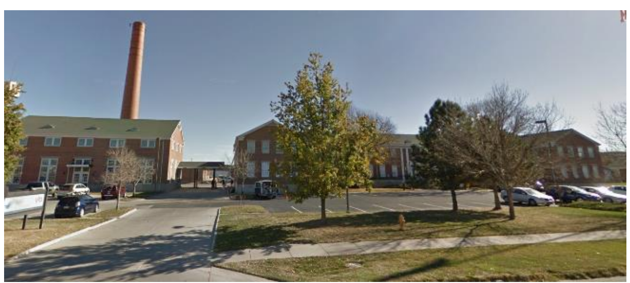
Property to the northeast of the subject site on York Street, looking east.