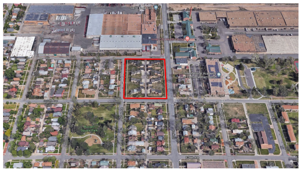
Aerial view of subject property, looking north.

The existing building form and scale of the subject site and adjacent properties are shown in the images on the following pages.