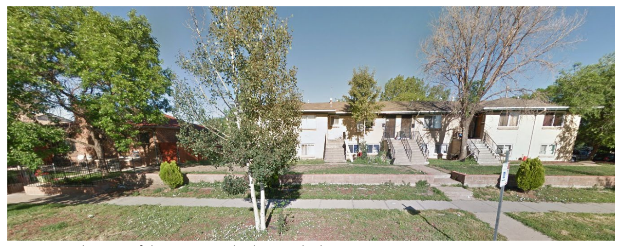
Property to the west of the site on Gaylord Street, looking west.