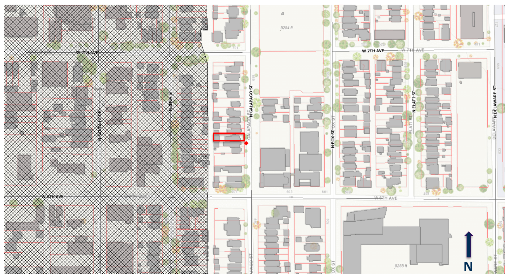
Blueprint Denver Areas of Change and Stability

Comprehensive Plan (2000) and Blueprint Denver (2002)