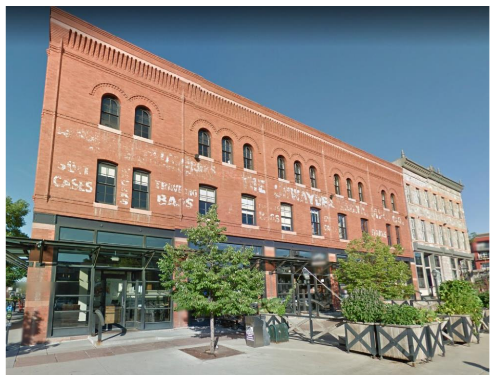
1553 Platte Street – Former Shwayder Trunk Mfg. Co. factory