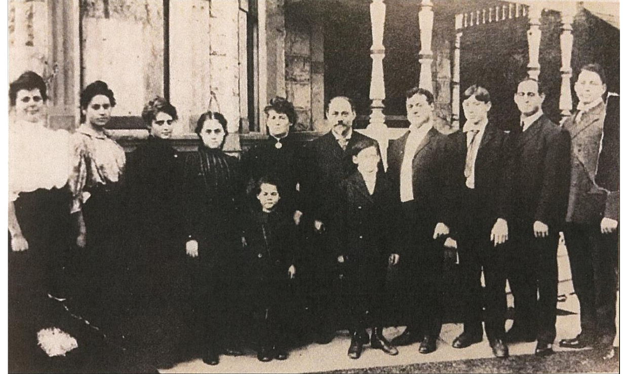
The Shwayder Family in front of 637 Galapago St, 1905