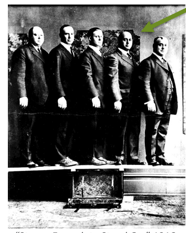
"Strong Enough to Stand On," 1916