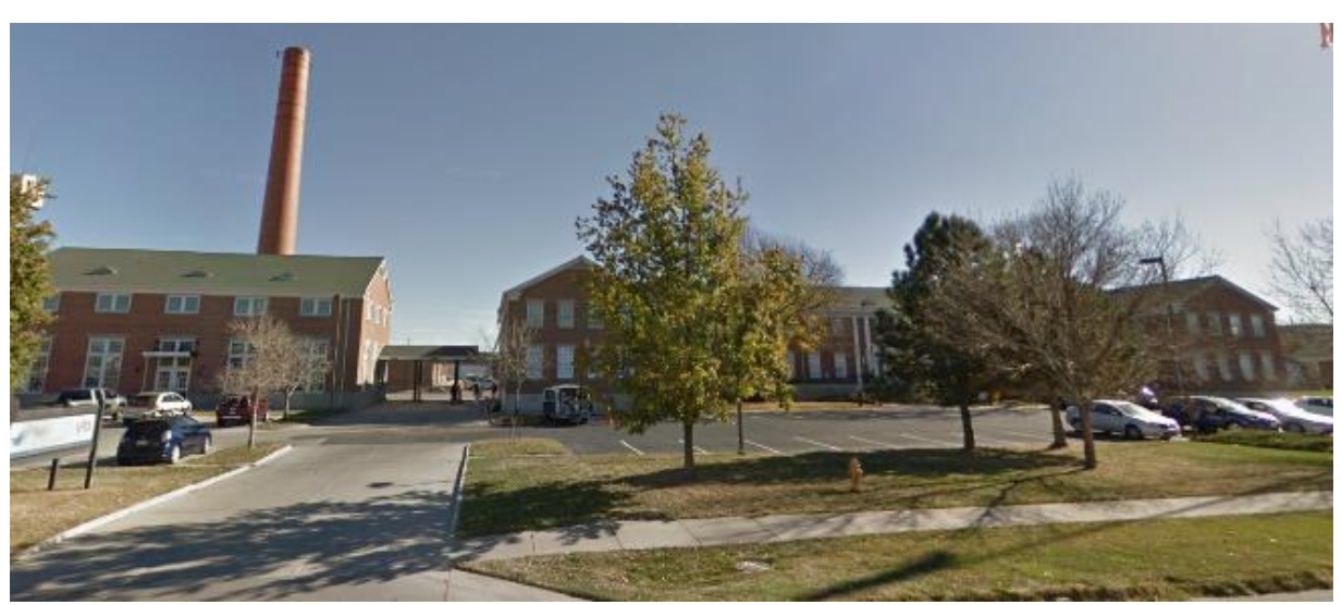
Property to the northeast of the subject site on York Street, looking east.