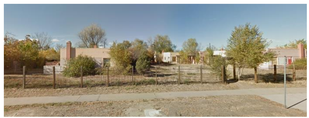
View of subject site on York Street, looking west.