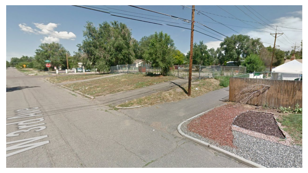
Subject Property Looking West

Surrounding Area Images