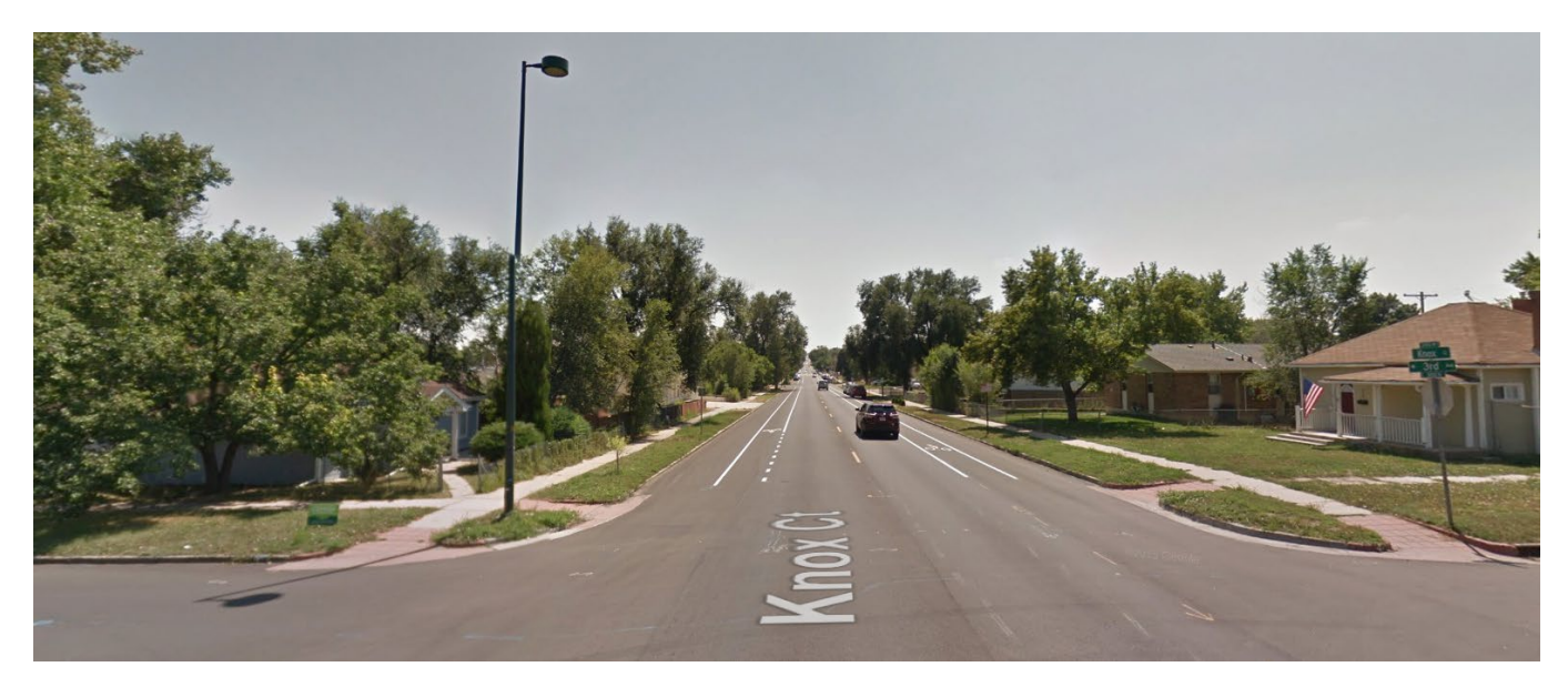
Surrounding Properties Looking South