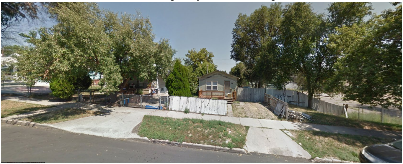
Surrounding Properties Looking North