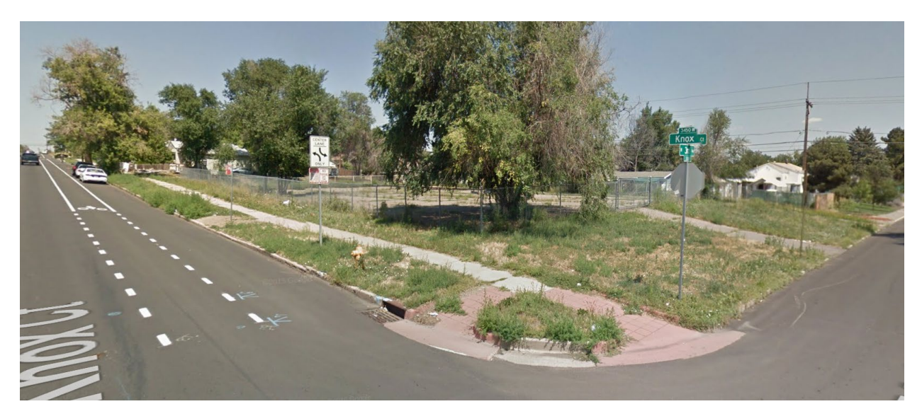
Subject Property Looking Northeast