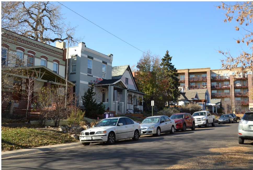
Figure 3 Looking southwest on West River Drive towards Jefferson Park

When combined with original key exterior materials, such as brick and stone, and the scale of each property, the district conveys a direct association with its period of significance and appears in stark contrast to much of its surroundings. The setting within the district boundary today is like what existed between 1885 and 1923; however, the surrounding area has several multi-family dwellings that are larger in scale than the properties originally built in the neighborhood. Each end of the district is anchored with new, multi-story residential properties.