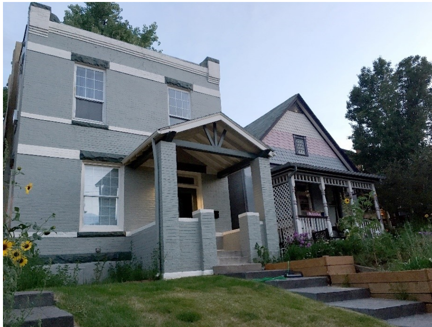
Figure 1 (l-r) 2568 W River Dr (Terrace Type) and 2572 W River Dr (Queen Anne/Gable Front)

Minor alterations include porch and window replacements as well as rear additions and new garages that are not visible from the street. These changes do not negatively affect the character-defining features of the district. The district provides an excellent snapshot of architectural styles and forms found in Denver in the late 1800s and early 1900s.