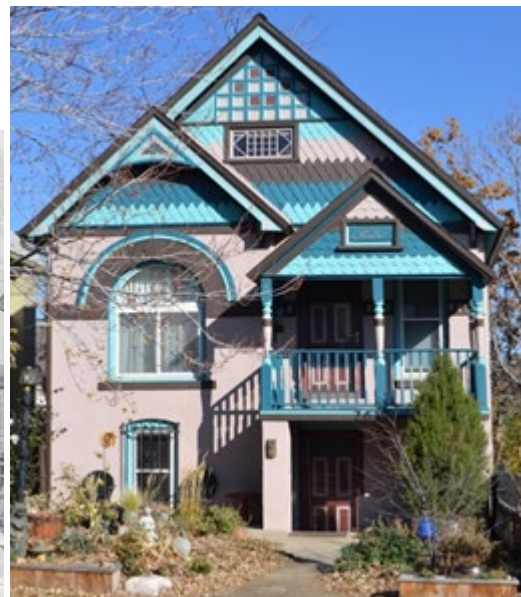
Figure 2 2617 W River Dr in 1894 and 2019 with modifications to original above grade front entry