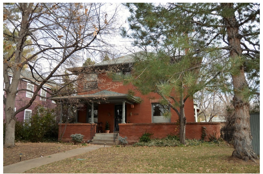
Figure 2 2288 S Milwaukee St, 2019

minimal decoration, broad overhanging eaves, classical frieze with dentils, and porch. It is unique given the absence of a full front porch and large dormer with a Palladian window, common design elements that Huntington included in other Foursquare designs yet illustrates other Huntington trademarks like the use of brick and rough-cut stone at the foundation, lintels and sills. It is an excellent, intact example of an early Foursquare form and Huntington design.