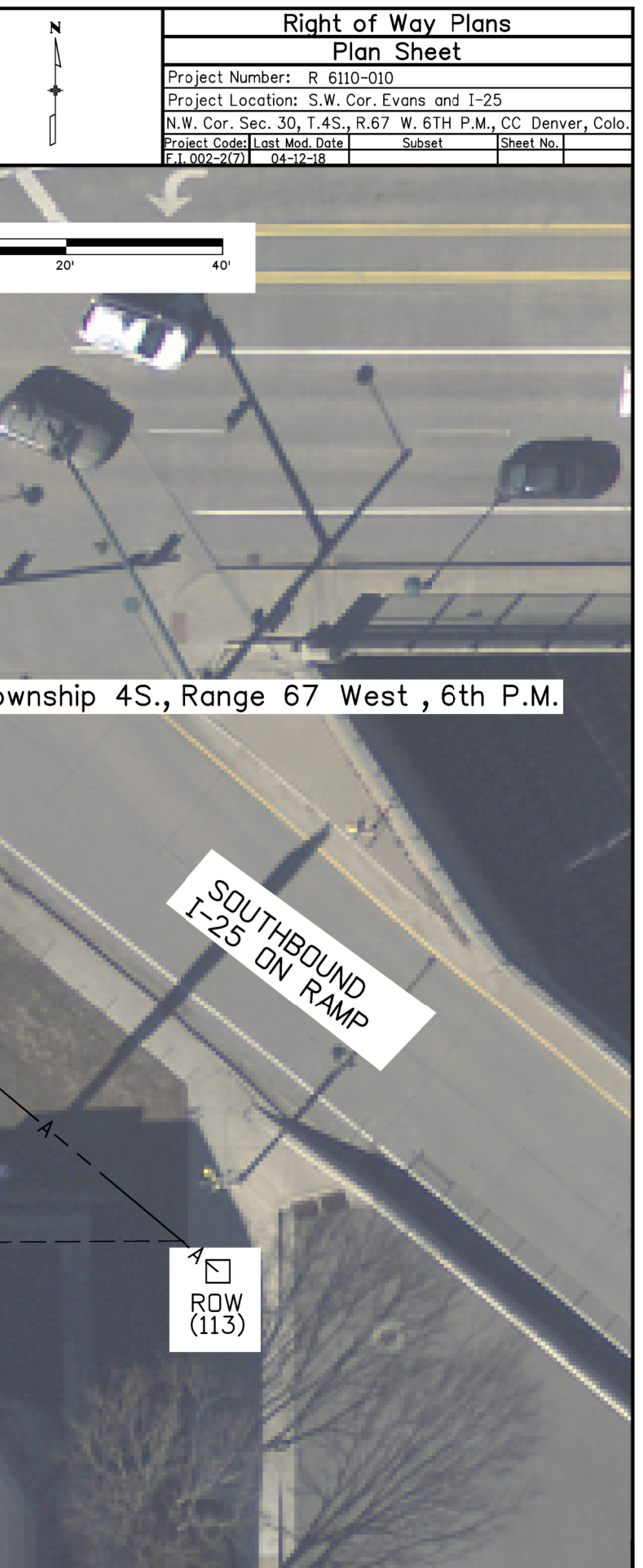
July 9, 2019 $1500 fee pd CC