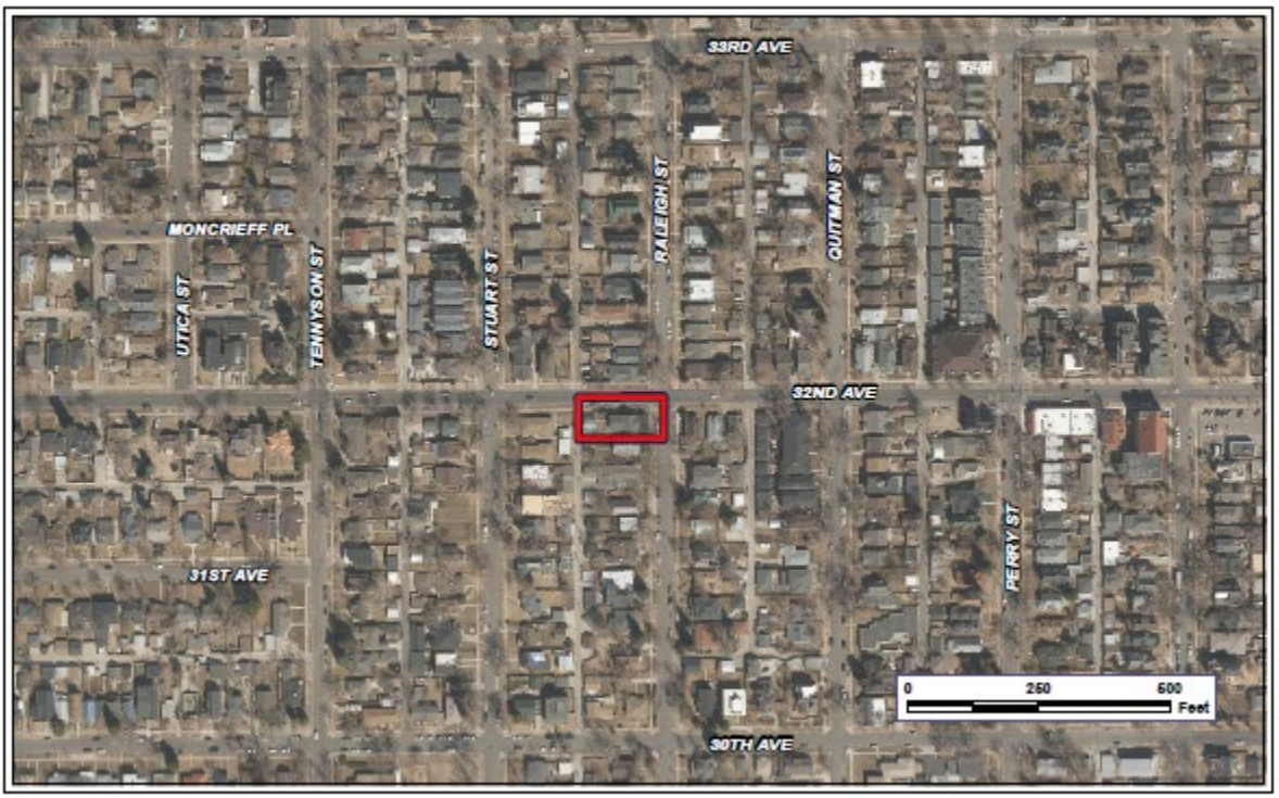
Map Date: July 2, 2019

The subject property is on the southwest corner of West 32nd Avenue and Raleigh Street. In the general vicinity are: