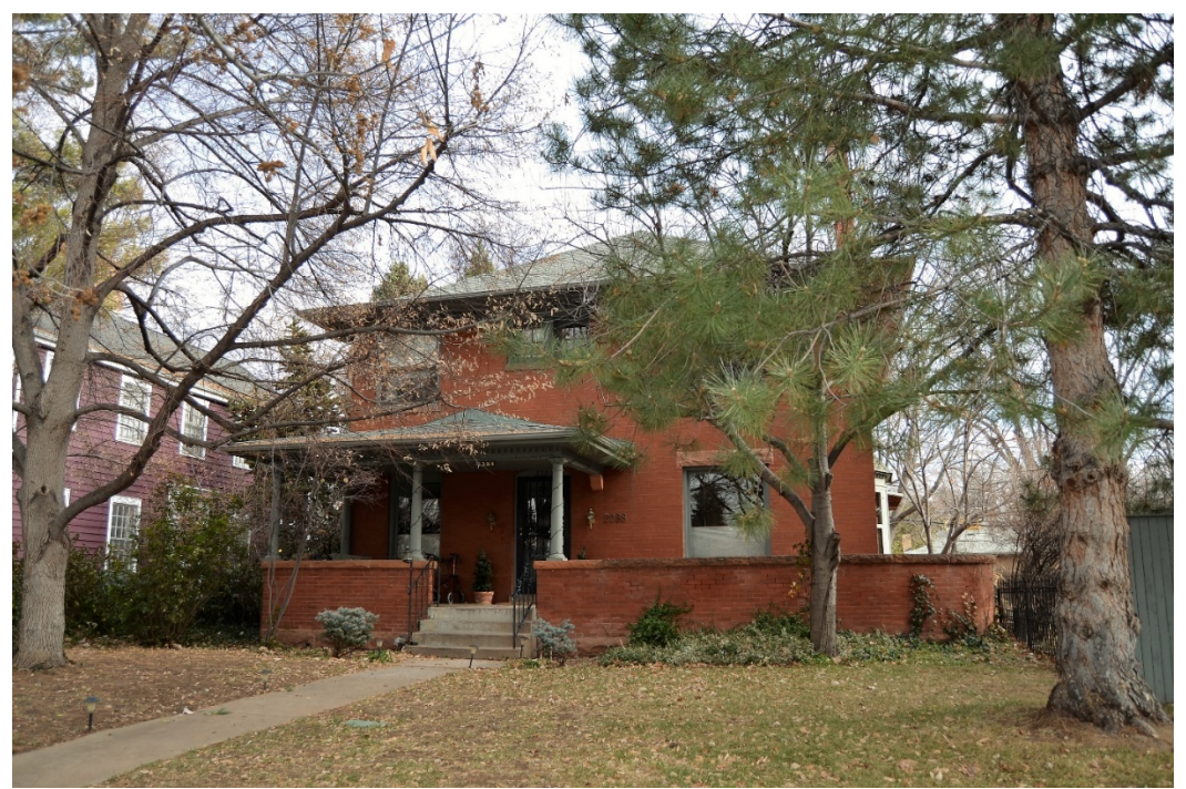
Figure 2 2288 S Milwaukee St, 2019

given its substantially-sized footprint and wraparound, uncovered front porch. It demonstrates the character-defining features of the Foursquare form as a two-story hipped roof structure with minimal decoration, broad overhanging eaves, classical frieze with dentils, and porch. It is unique given the absence of a full front porch and large dormer with a Palladian window, common design elements that Huntington included in other Foursquare designs yet illustrates other Huntington trademarks like the use of brick and rough-cut stone at the foundation, lintels and sills. It is an excellent, intact example of an early Foursquare form and Huntington design.