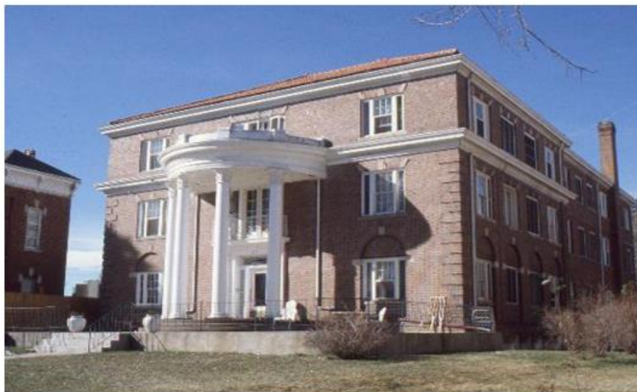
Photos: Patients Building ca. 1924-25 and 2018.