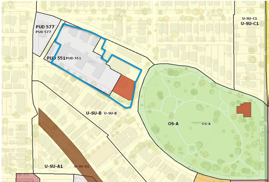
Zoning: PUD 551 and U-SU-B (proposed district noted in blue, red and brown indicate existing Denver landmarks)

The District is zoned U-SU-B and PDU 551.