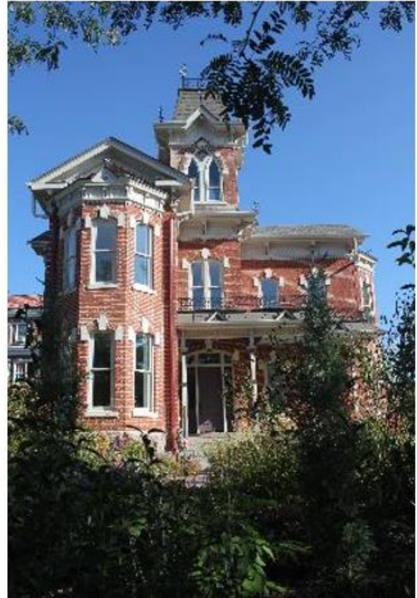
Photos: Administration Building/Bosler House ca. 1924-25 and 2018.