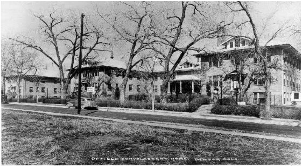
Photo: Main Building ca. 1946

Building's near 300 feet length, footprint of more than 13,000 square feet and rising three and a half stories has visually dominated this block of West Fairview Place since its completion in the early 1920s. Generous sized front lawns tie the Administration Building/Bosler House, Patient Apartments and the Main Building to the neighborhood streetscape. The setting provides a broad expansive view of the campus from the open public space of the Highland Park on the east, inherently creating an established, familiar, and orienting visual feature.