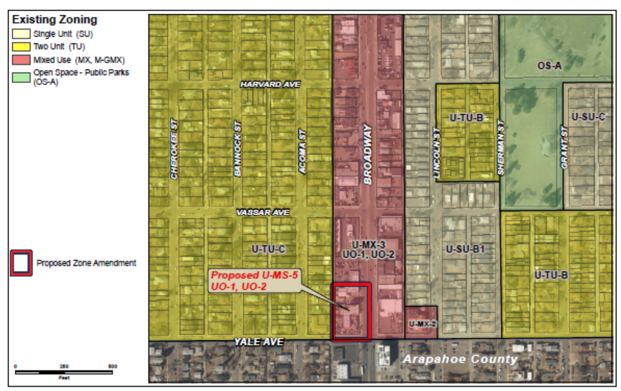
Map Date: November 20, 2019

The subject site is currently zoned U-MX-3, UO-1, UO-2. U-MX-3 is a mixed use zone district allowing the Town House and the Shopfront primary building forms with Drive Thru Services and Restaurants allowed unless the zone lot is within ½ mile of the outer boundary of a Rail Transit Station Platform. The district allows a maximum height of 38-45 feet. The district allows a variety of residential, civic, and commercial land uses. The proposed UO-1 and UO-2 overlay district will carry forward the existing entitlements allowing adult uses and the existing billboard, subject to limitations. See the UO-2 Billboard Use Overlay map below. The hashed areas on the map are areas where new billboards would not be allowed.