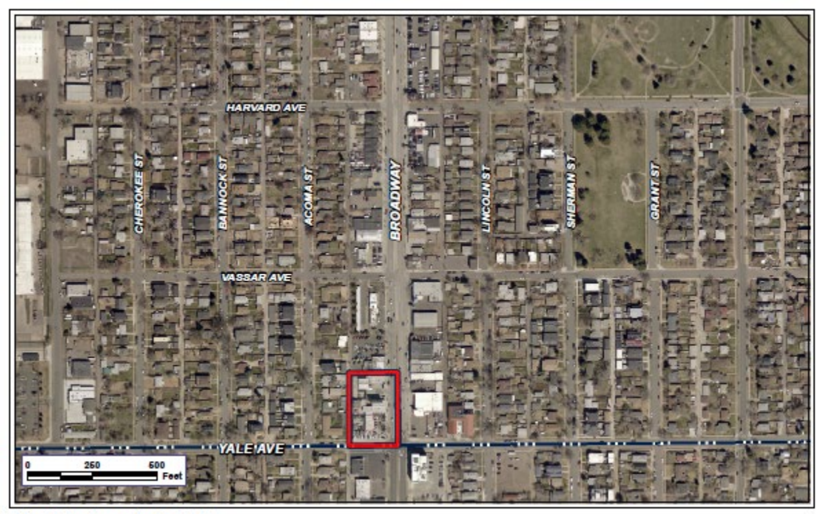
Map Date: November 20, 2019

The subject property is in the Overland statistical neighborhood, which has primarily industrial land uses with mixture of single- and two-unit residential uses surrounded by either industrial, commercial or park land uses. South Broadway forms the eastern boundary of the neighborhood and the South Platte River forms the western neighborhood boundary. Mississippi Avenue forms the northern boundary of the neighborhood and Yale Avenue forms the southern boundary. There is a pattern of rectangular blocks shaped by a street grid pattern. A nearby bus stop on the east side of Broadway at Yale includes a stop for the route 0 and 0 Limited bus lines on South Broadway Street with 5-10 minute headways. The subject property is two blocks southwest of City of Kunming and Rosedale Park, and 8 blocks west of Porter Hospital and ½ block west of Swallow Hill Music. South Santa Fe Drive is 6 blocks to the west and the South Platte River is 8 blocks to the west.