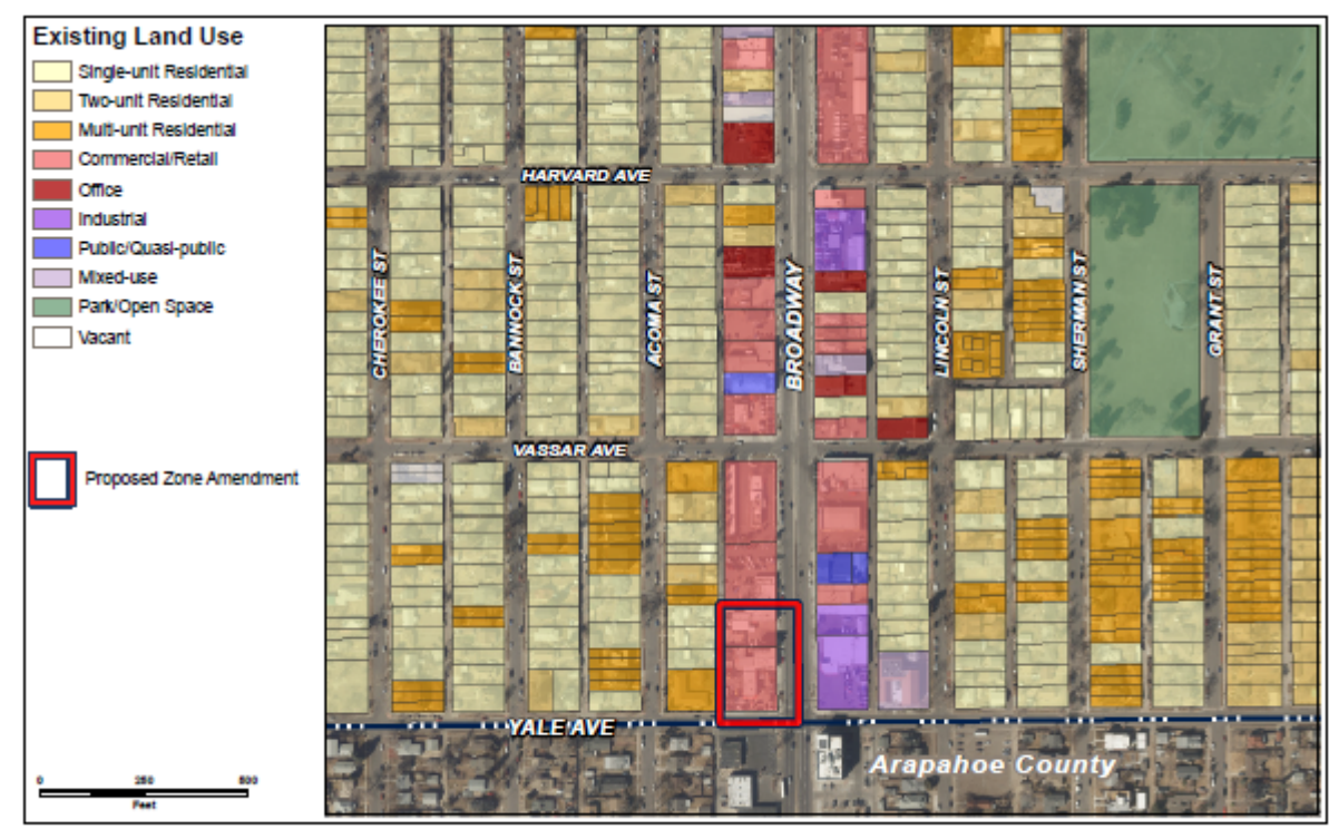
Map Date: November 20, 2019