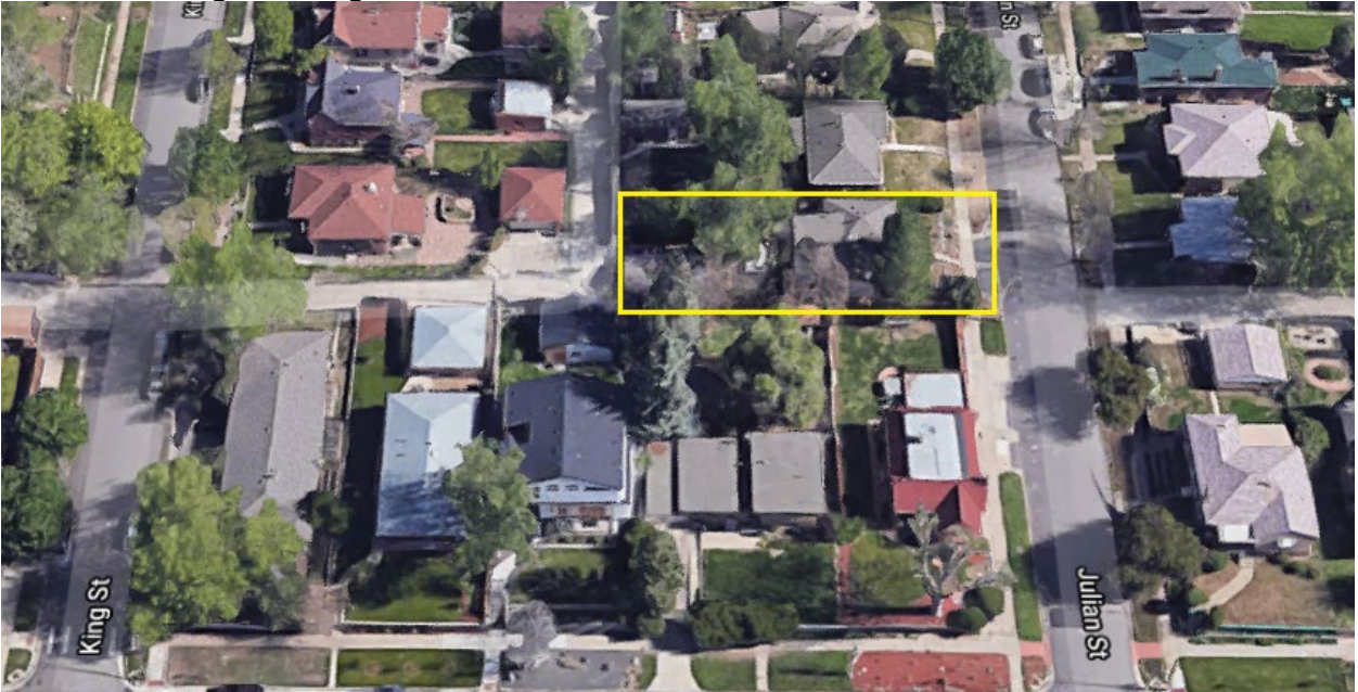
Aerial view of the site, looking north.