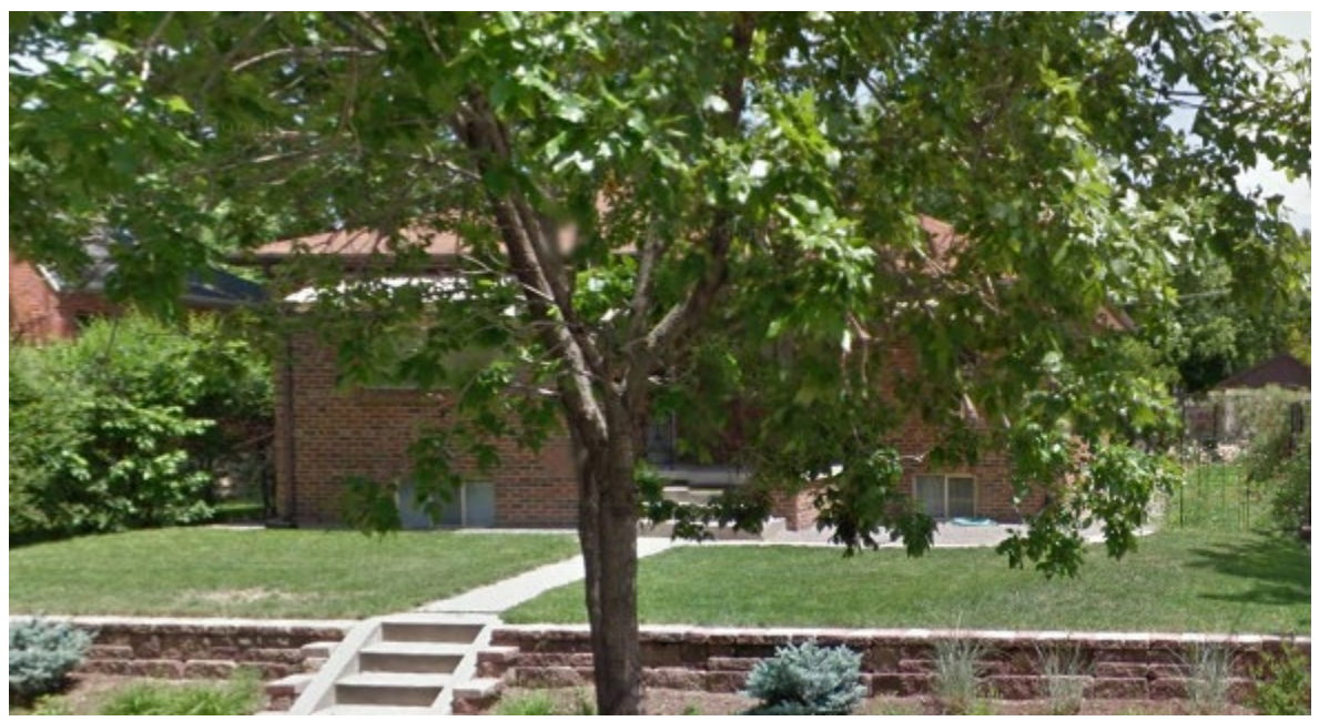
View of the property to the west across the alley, looking east.