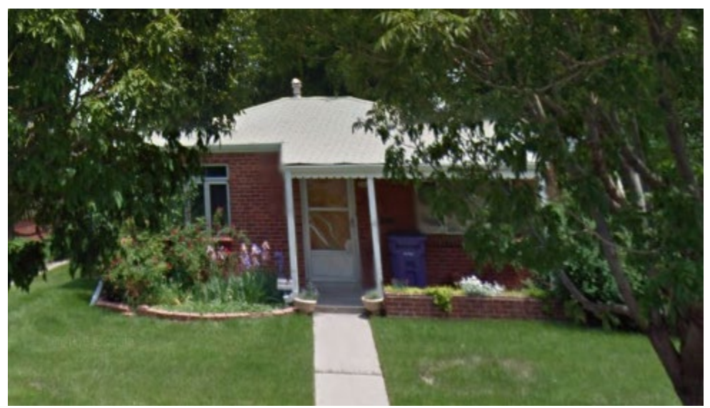
View of the property to the east across Julian Street, looking east.