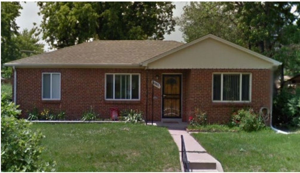
View of the property to the north, looking west.