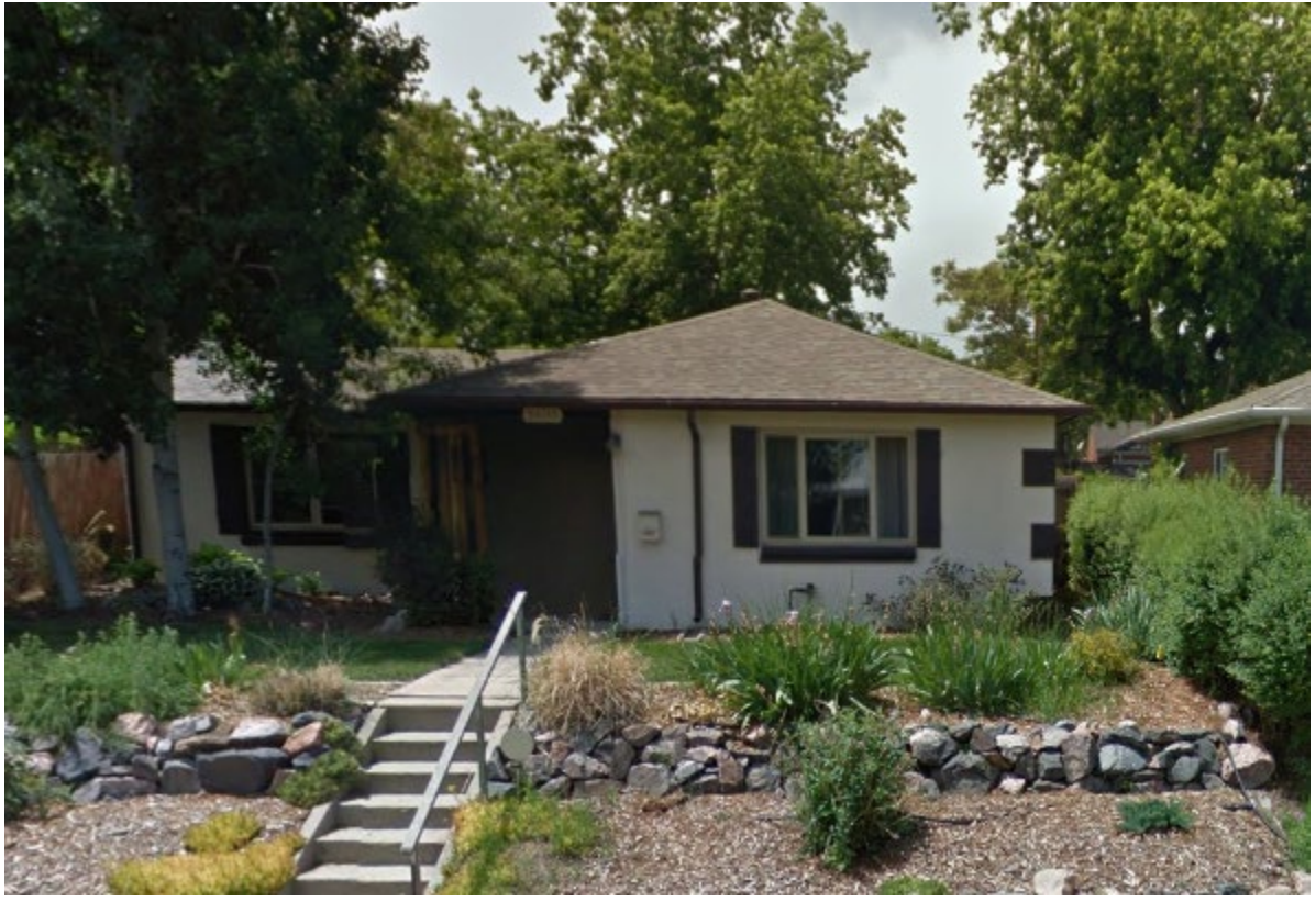
View of property looking west.