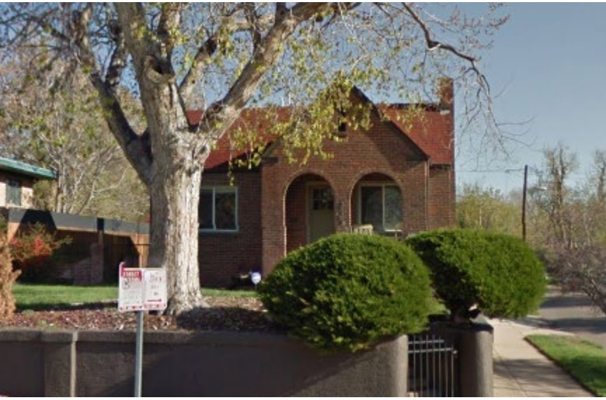
View of the property to the south, looking north.