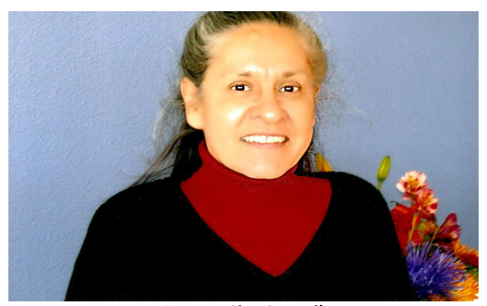
Denver City Council February 24<sup>th</sup>, 2020