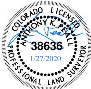
EXHIBIT ATTACHED AND MADE A PART HEREOF.