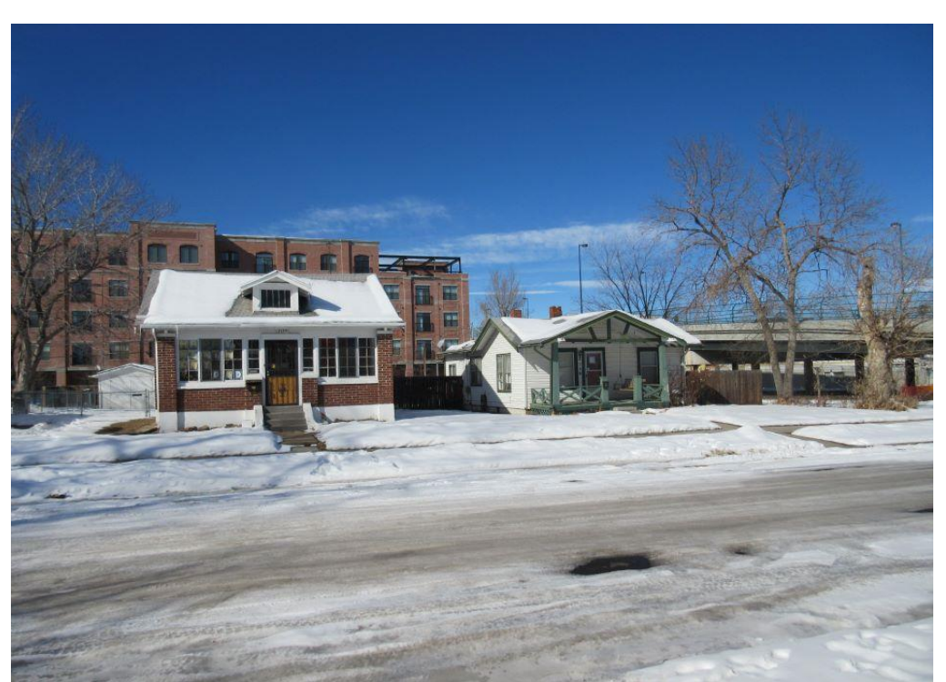
Photo 2 - Subject Property: The Property for which the Zone Map Amendment is being proposed consists of five lots occupied by two older single-family homes close to the end of their useful economic lives. The property is located on the western side of South Cherokee Street at the north end of the block adjacent to the West Evans Avenue Service Road and the West Evans Avenue Bridge.