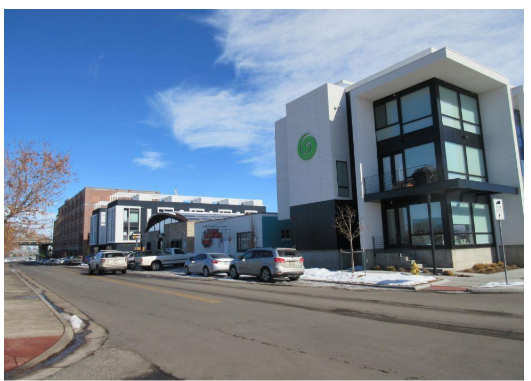
Photo 1 - Recent Development on South Delaware South of Evans Station Lofts: Delaware Street was zoned C-MX-5 in 2010, but there was almost no market for market-rate apartments or other station area retail. RTD Light Rail alone could not generate new business where there were not enough roof-tops already. In 2014, The Evan Station Lofts were completed as affordable subsidized rental housing. In recent years, the area has changed substantially with many new multi-unit developments filling up the block on Delaware Street. The Evans Station Area Vision Statement uses fundamental principles of Transit Oriented Development (TOD) as a foundation and contributes to "Denver's success in implementing the 2006 Transit-Oriented Development Strategic Plan: 'Enhance the Evans Station area's sense of place by creating a vibrant and sustainable urban neighborhood that encourages people to live and work; invites businesses to thrive; allows people to comfortably walk, bike, or use transit to access local services and attractions; and maintains the residential character of the surrounding community.' " (Evans Station Area Plan, Pg ix).