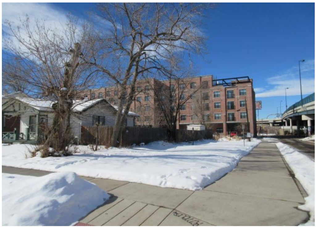
Photo 3 - Subject Property: The Evans Station Loft Apartments, a significant, multi-unit housing project in the adjacent C-MX-5 District is directly across the alley to the west.

Photo 2 - Subject Property: The Property for which the Zone Map Amendment is being proposed consists of five lots occupied by two older single-family homes close to the end of their useful economic lives. The property is located on the western side of South Cherokee Street at the north end of the block adjacent to the West Evans Avenue Service Road and the West Evans Avenue Bridge.