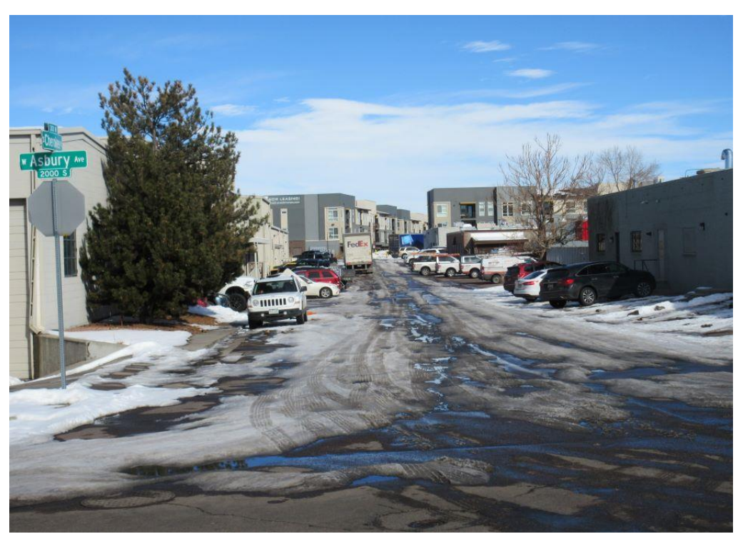
Photo5 - Development on South Cherokee Street North of Evans: In 2018 and 2019, parcels have been re-zoned to C-RX-8 and C-MX-5 on South Cherokee Street north of the Evans Bridge.

Photo 4 - Development on South Cherokee Street North of Evans: More intense developments of 5 to 8 stories is under construction or in the planning stages north of Evans Avenue extending north to Mississippi.