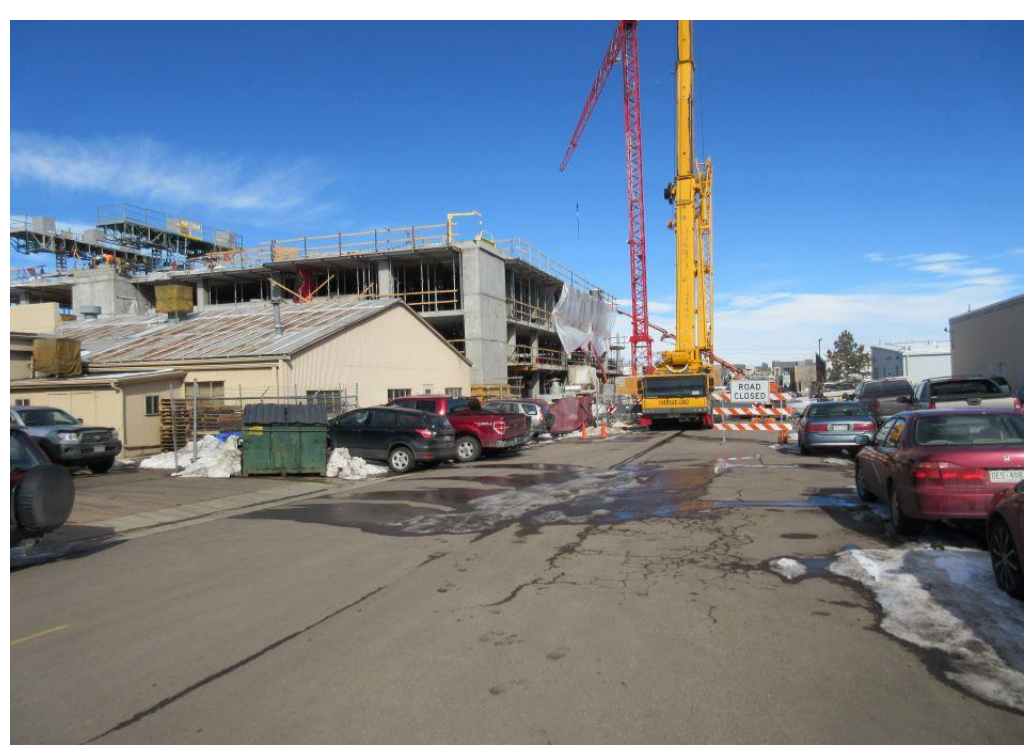
Photo 4 - Development on South Cherokee Street North of Evans: More intense developments of 5 to 8 stories is under construction or in the planning stages north of Evans Avenue extending north to Mississippi.