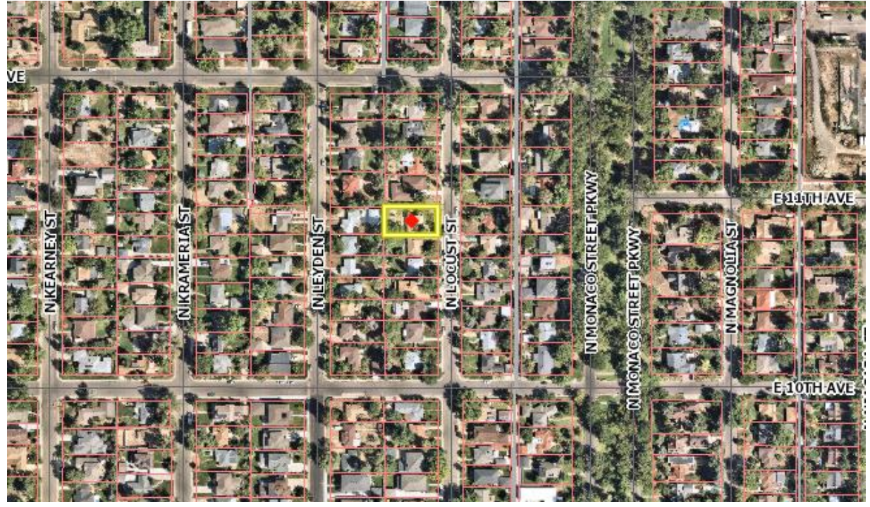
Aerial view of the site outlined in yellow.

3. Existing Building Form and Scale