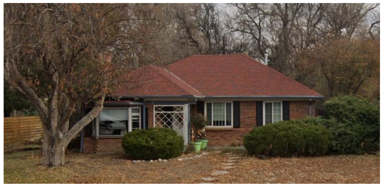
View of the property to the east.