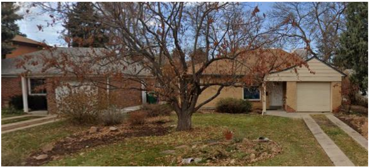
View of the property to the south, looking east.