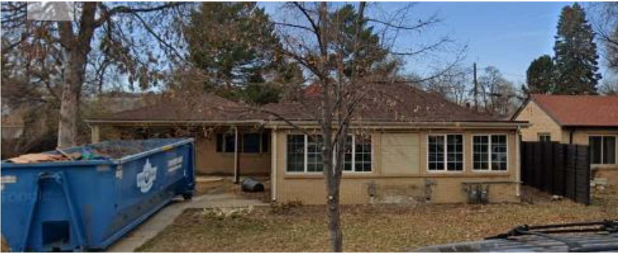
View of the property to the north, looking east.