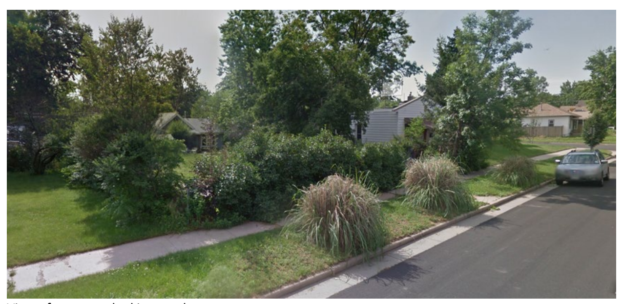
View of property, looking southeast.