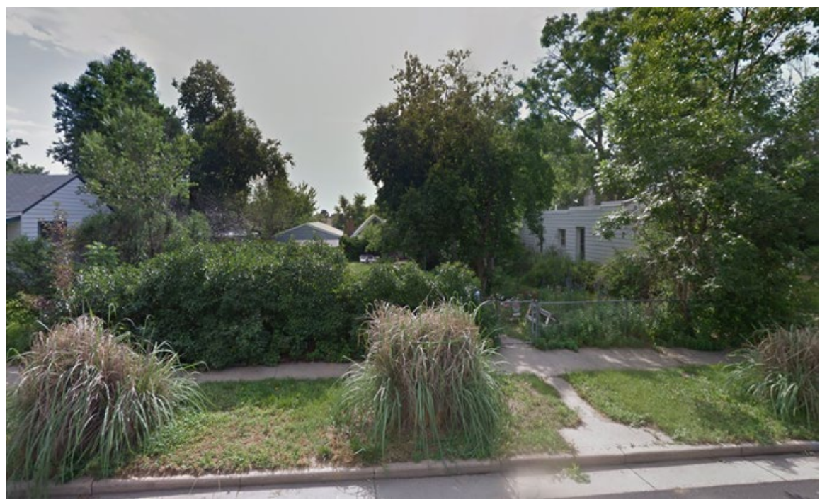
View of property looking east.