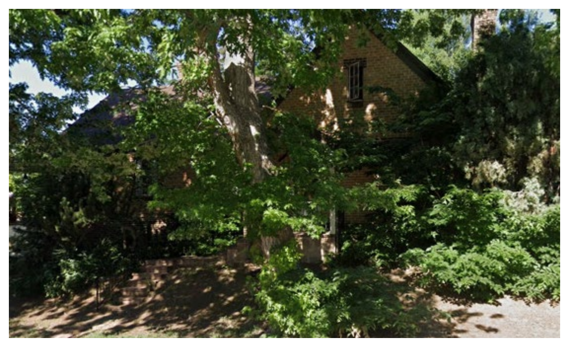
View of the property to the east, looking west.