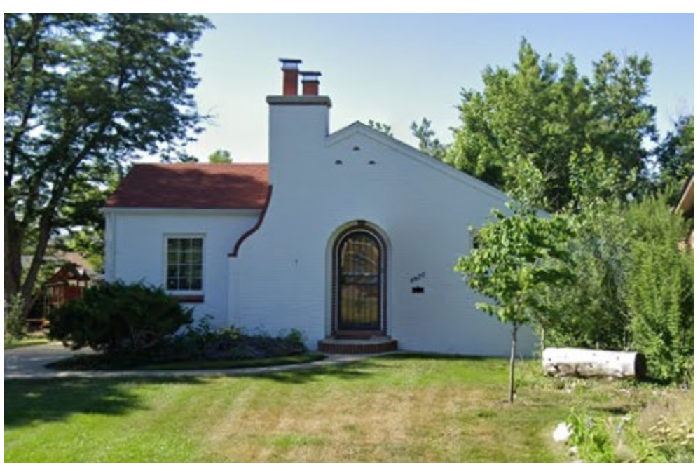
View of property looking south.