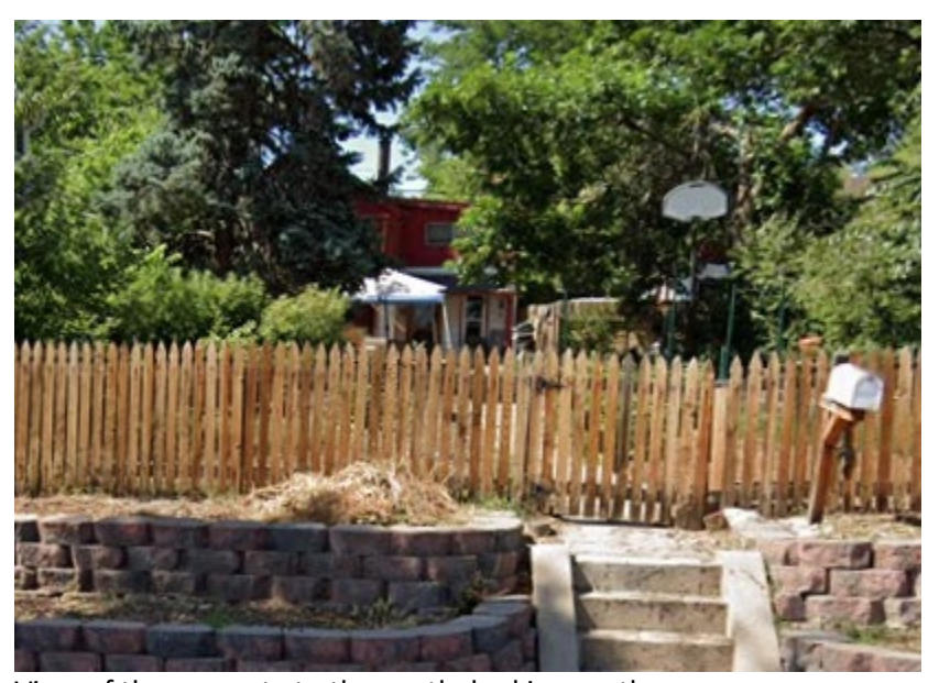
View of the property to the south, looking north.