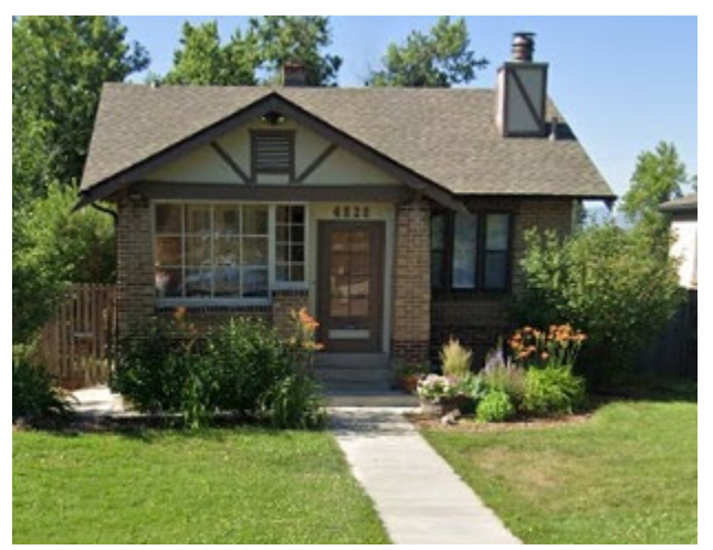
View of the property to the east, looking south.