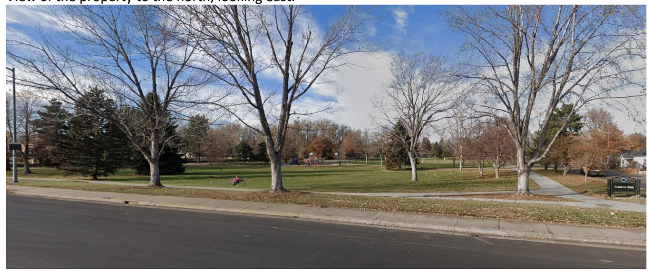
View of the park to the west, looking north.

View of the property to the north, looking east.