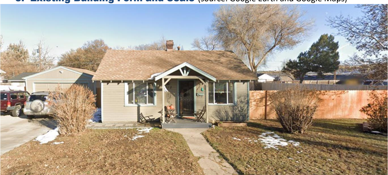
View of property looking east.