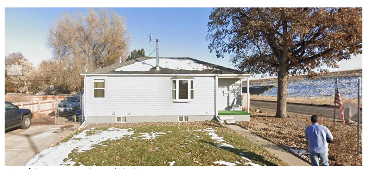
View of the property to the south, looking east.