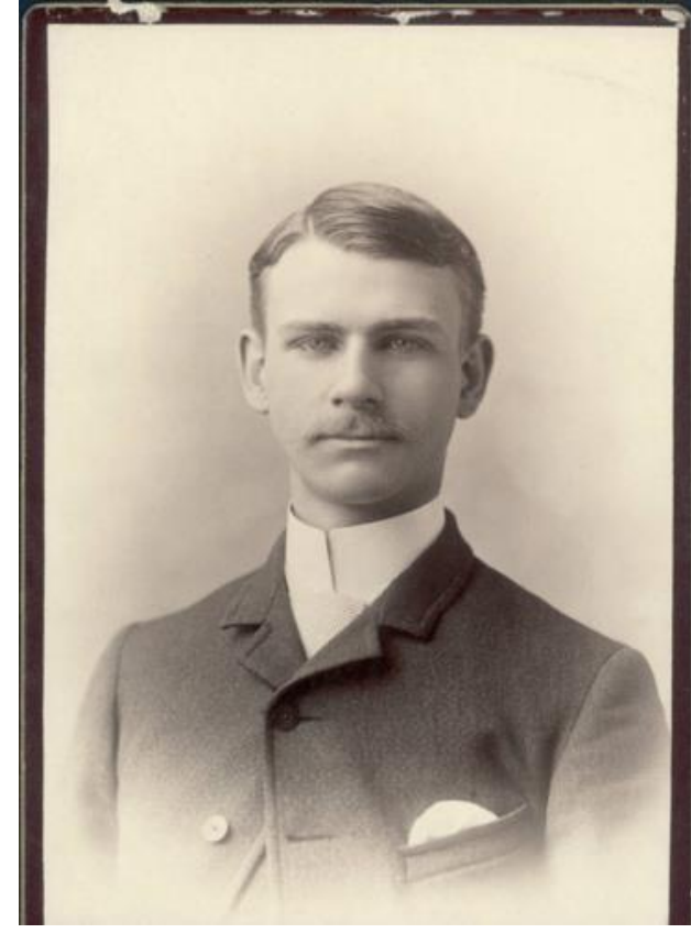
B. Association with a recognized person or group of persons who had influence on society