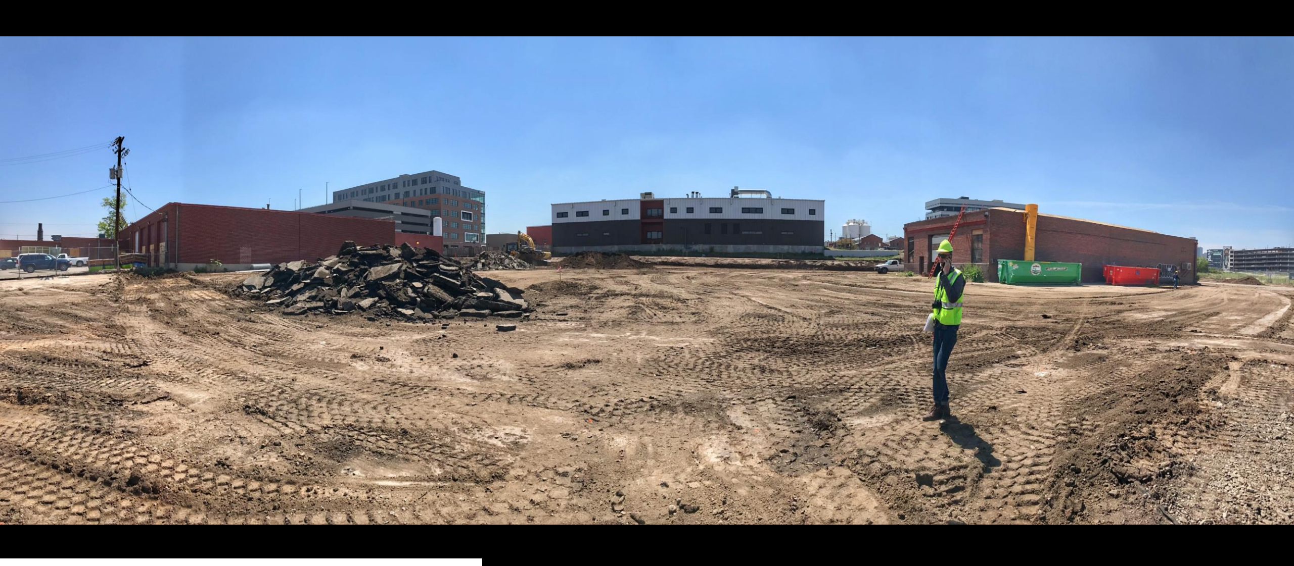
March 2019 – First site visit with partners