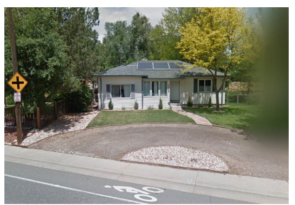
View of property to the west, looking north.