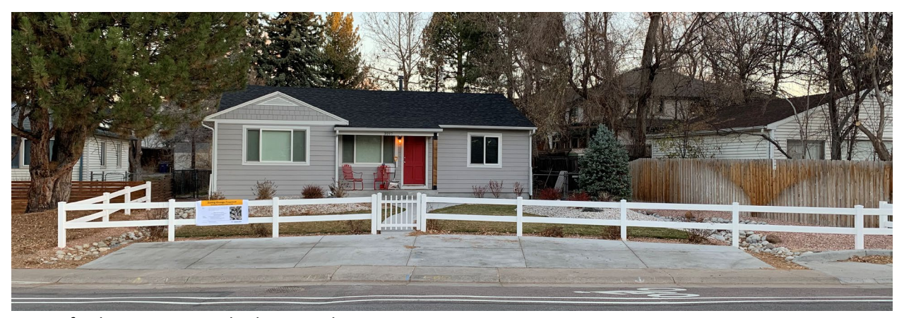
View of subject property, looking north.