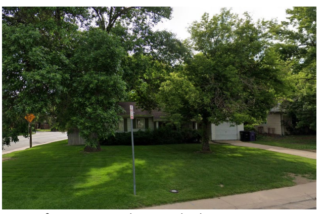
View of property to the east, looking west.