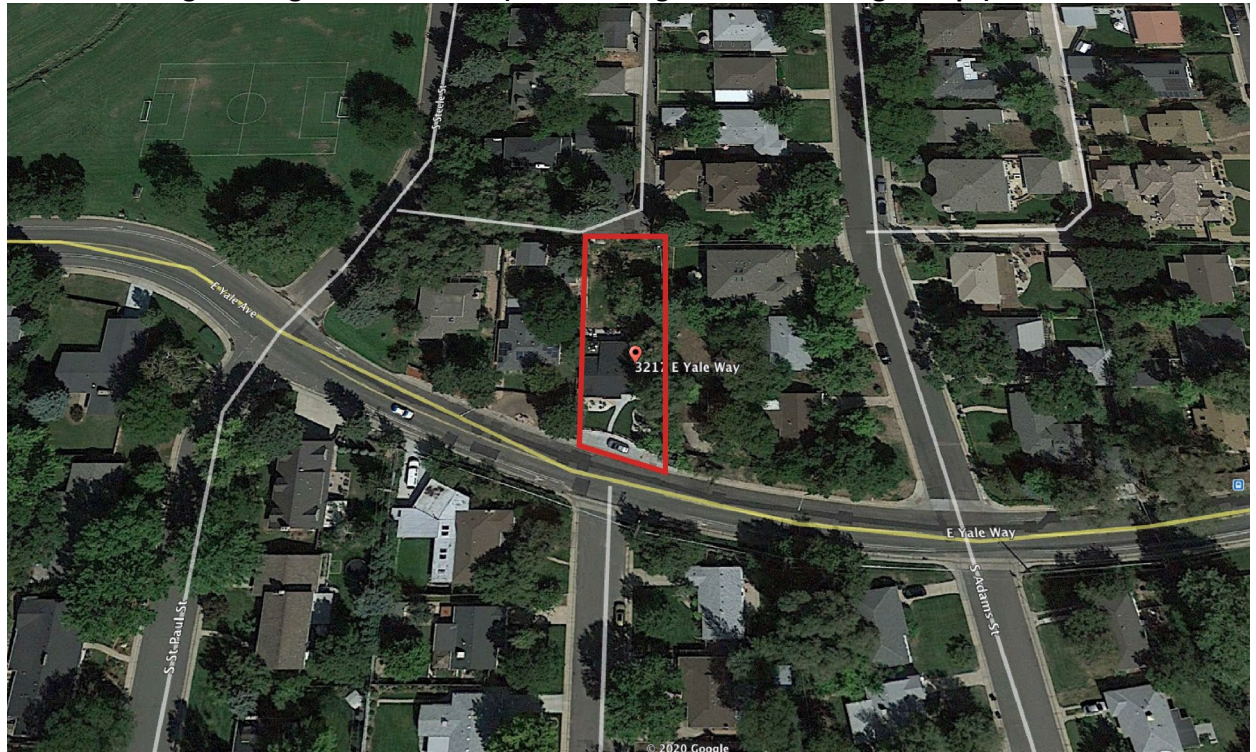
Aerial view of the site looking north.

3. Existing Building Form and Scale