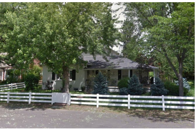
View of property to the northwest, looking east.