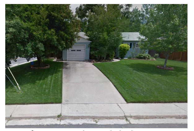
View of property to the south, looking east.