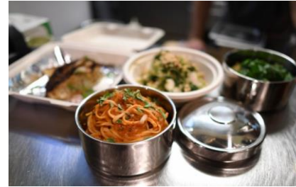
Denver Post, 11.25.20