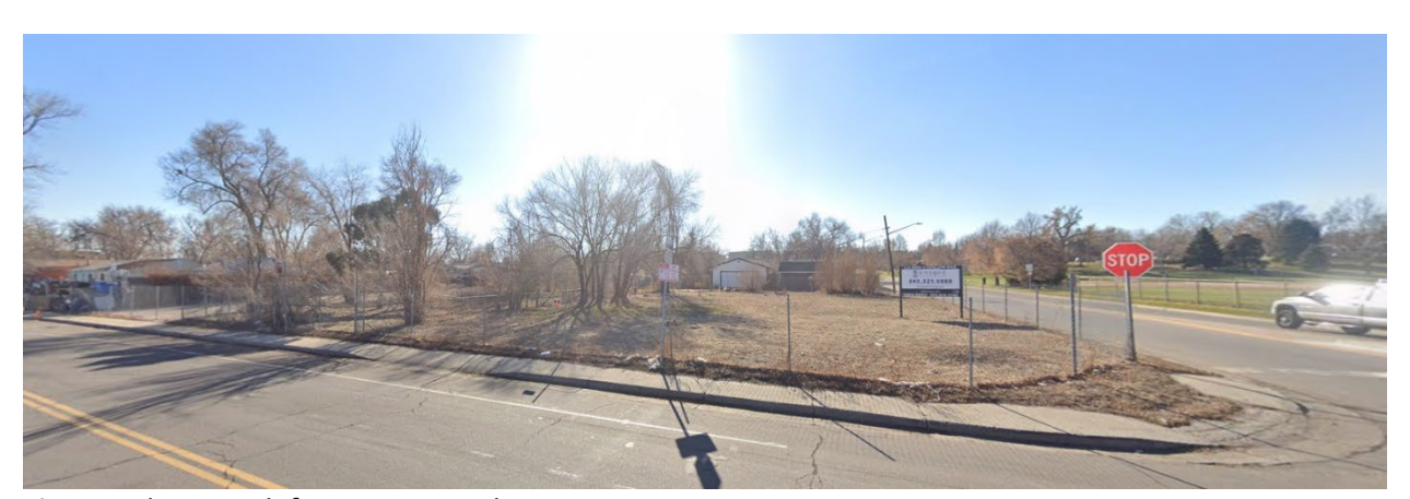
Site - Looking south from W. Bayaud Avenue