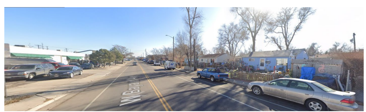
East - Looking east down W. Bayaud Avenue