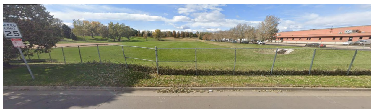
West - Looking west from W. Tejon Street