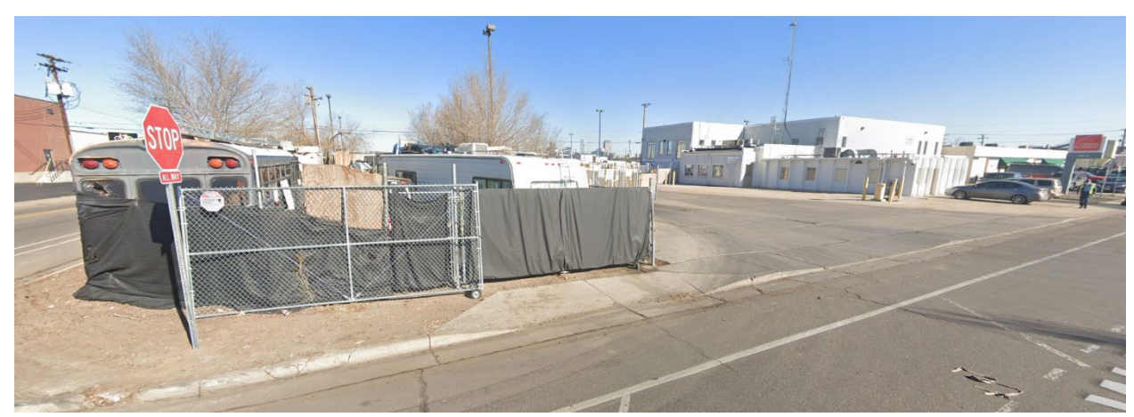
North - Looking northeast from W. Bayaud Avenue