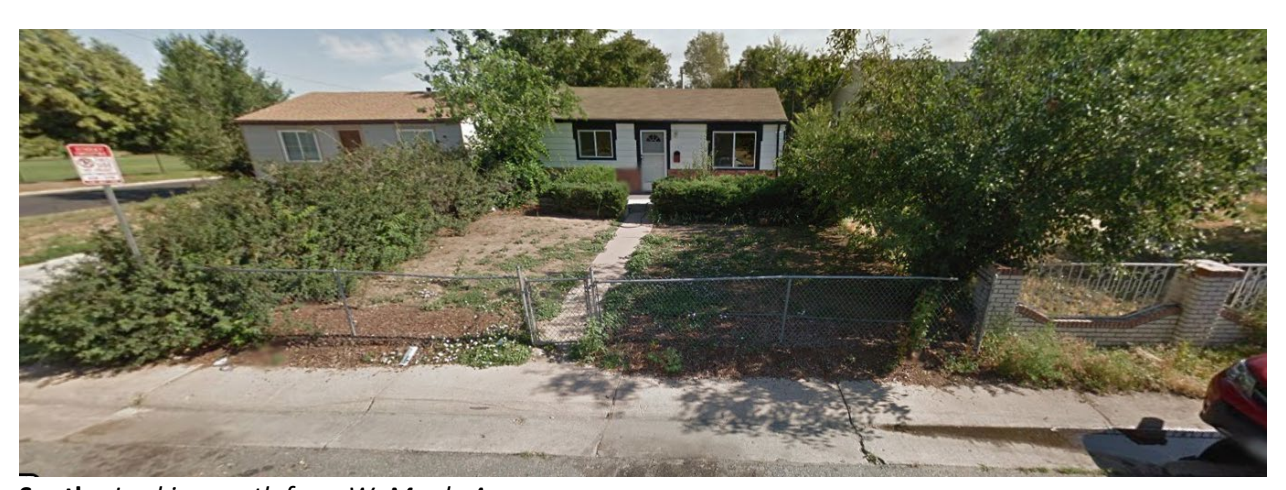
South - Looking north from W. Maple Avenue