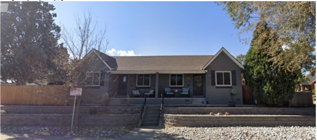
Properties directly to the west, as seen from N Irving St