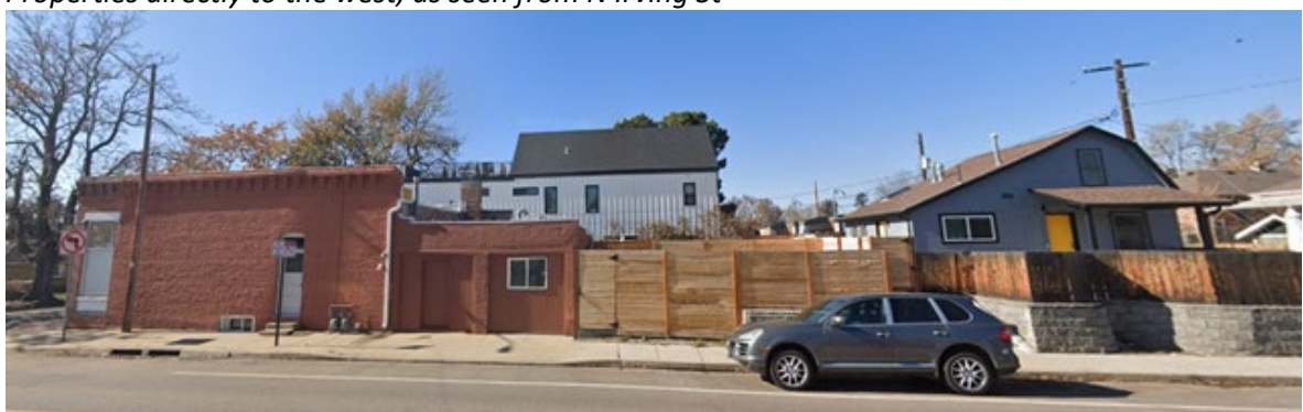
Properties to the west, as seen from N Irving St