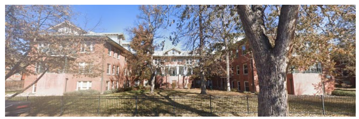
Properties to the east, as seen from W Fairview Pl