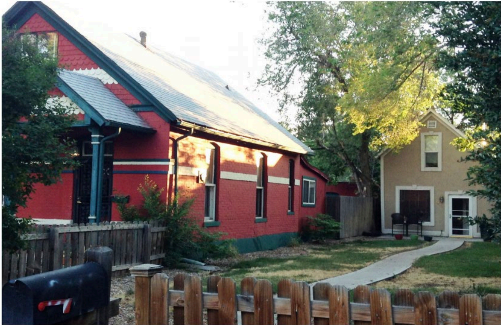
4. A “honeymoon” or alley house is shown deeply setback from the street, ready to accommodate a new house on front portion of lot in the future.

3431 is a “honeymoon” house as defined by this Denver Gov .pdf on neighborhood characteristics