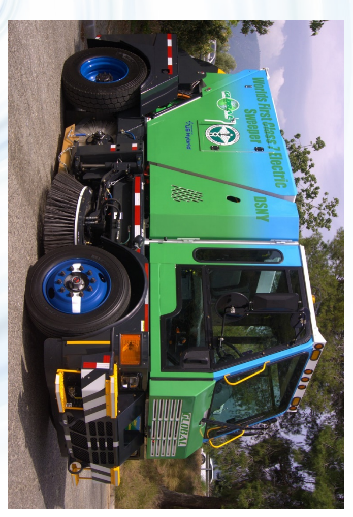
With travel speed of 55-MPH and a battery operational range of up to 11 hours , towns, villages and large cities will be able to clean the streets while protecting our environment and building a cleaner future with ZERO EMISSIONS . At the end of the shift just plug in the sweeper, recharge the batteries and sweep again.