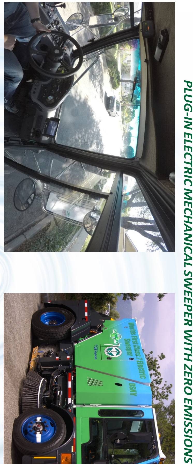
center mounted/cab forward layout the operator has unsurpassed visibility of the road surface as well as pedestrians and surrounding traffic. The large hopper capacity equals more lane miles swept between dump cycles and the 18.5-foot turning radius makes the Electric Global M4 highly efficient and comfortable. The inherent design of the Electric Global M4 makes it the only choice among 4-wheel mechanical sweepers. With the

rail road tracks and will not damage while sweeping. Long are designed so that operator has sweep over potholes and LONG LASTING DIRT SHOES Polyurethane Dirt Shoes