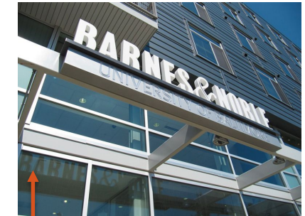
Canopy Sign Examples - Allowed