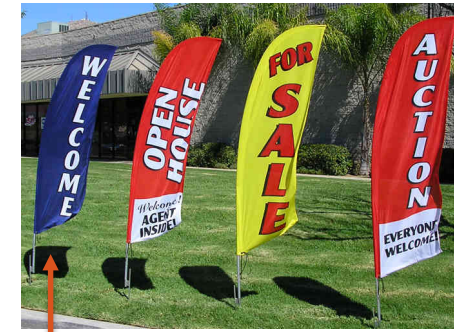
Wind Sign Examples - Allowed