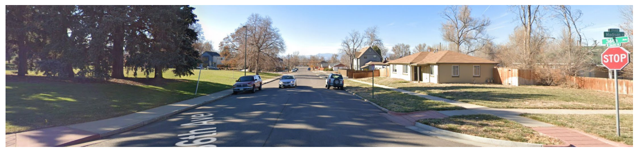
View of the property to the east (other side of the alley), looking west.