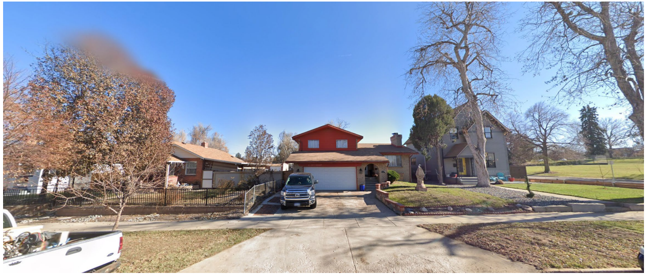
View of the property to the north, looking east.