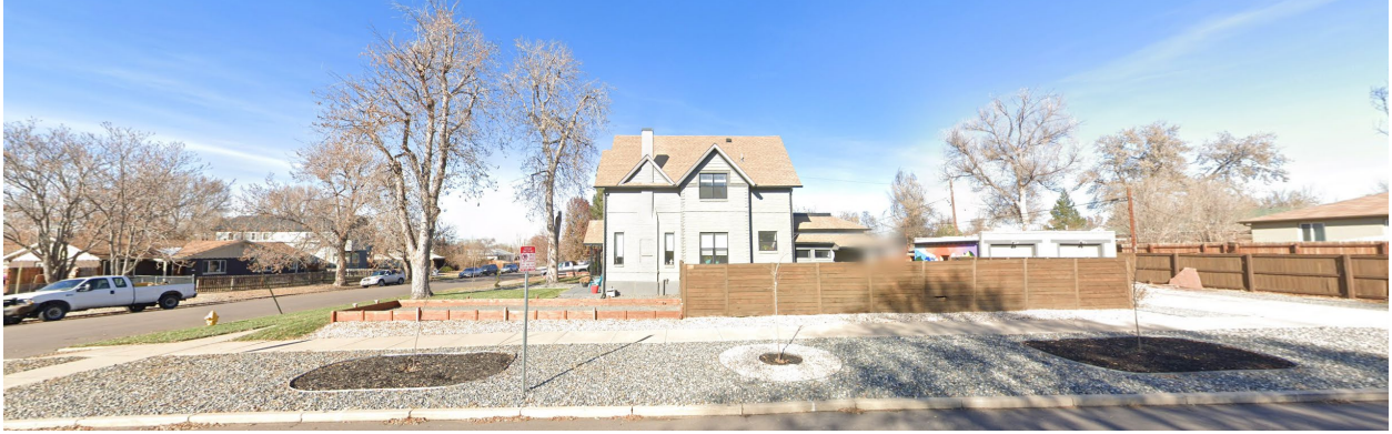
View of the subject property, looking north.