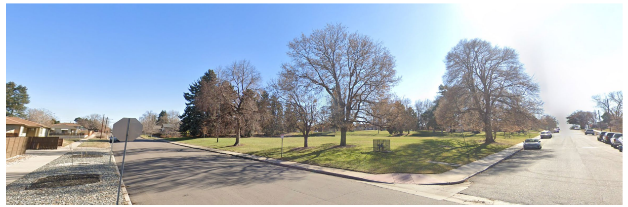
View of the City of Nairobi public park to the south (other side of East 36<sup>th</sup> Ave.), looking southeast.