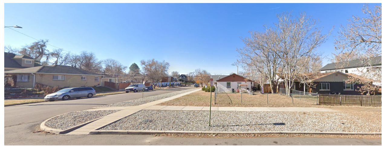
View of the property to the west (other side of North Cook Street), looking west.