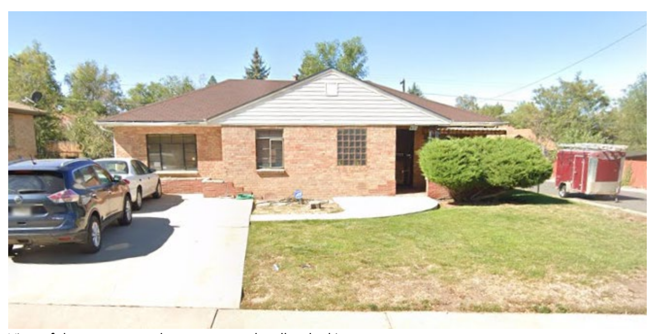
View of the property to the east across the alley, looking west.