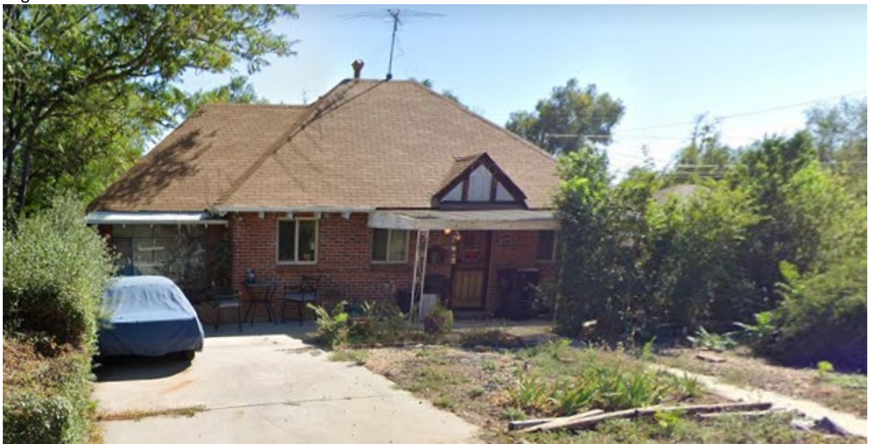
View of the property to the north, looking east.