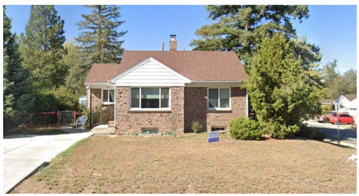
View of the property to the west across S. Canosa Ct., looking west.