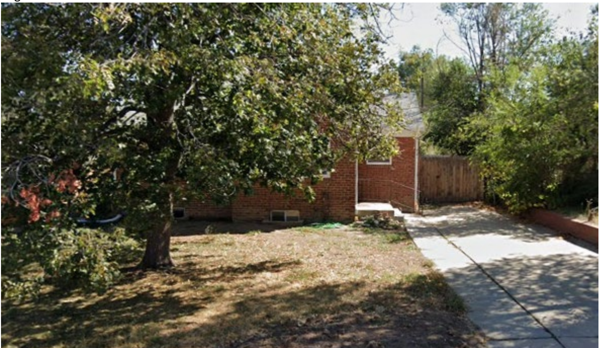
View of the property to the south looking east.